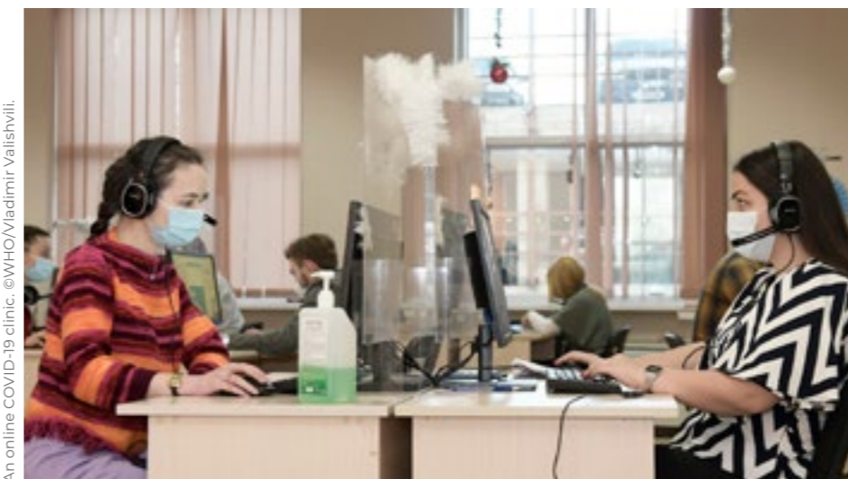
An online COVID-19 clinic.

Access to quality health care is a concern the world over, and the European Union is proud to be working closely with WHO to develop this in 115 countries globally, including in Georgia. During the pandemic, our joint efforts here have focused on training and the roll-out of updated COVID-19 procedures, together with substantial material support, as part of the EU’s wider support to the country during these challenging times.