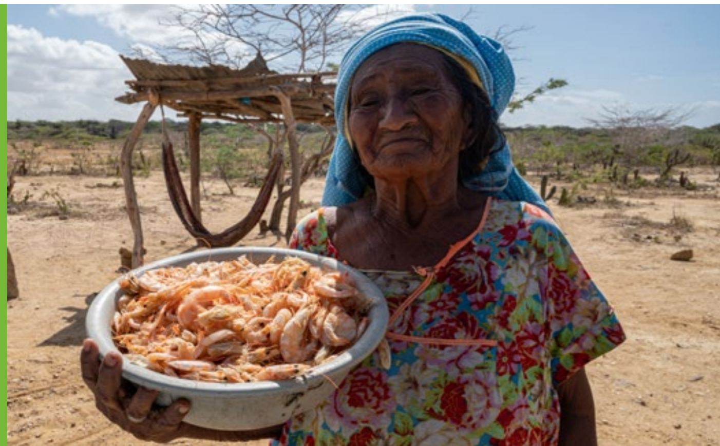
A woman from the Wayuu community in Alta Guajira, Colombia.

Without the participation of the general public in terms of hygiene and self-protection, it would be impossible to stop the spread of COVID-19, leading Colombia to quickly call on its citizens to take action. The first step was a mandatory mass quarantine to reduce contagion, followed by a flexible quarantine phase with gradual de-staging, and this helped to mitigate the social and economic effects caused by the pandemic.