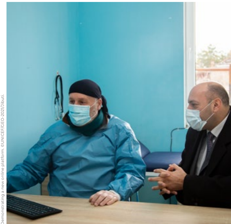
Demonstrating a new online platform.

Greater investment in rural infrastructure, telemedicine equipment and better communication systems is needed to reach populations currently not using PHC services. Strong community-based strategies, and engaging patients and organizations, will increase trust and use of the services available. For Georgia, these are crucial steps in tackling the pandemic and ultimately achieving UHC.