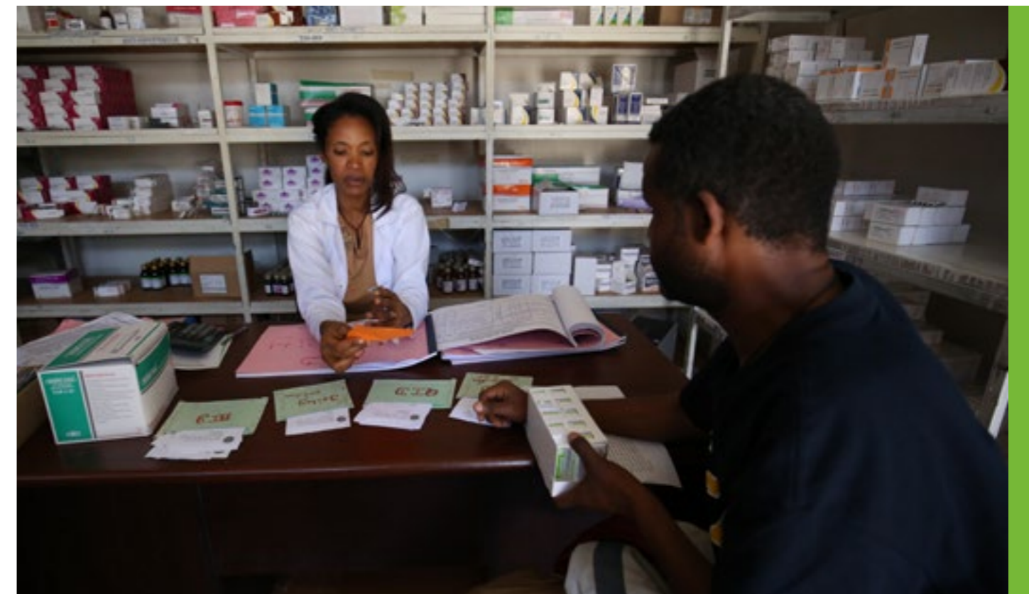
A pharmacist gives information to a patient as she dispenses his medicines at a pharmacy at Zewditu Memorial Hospital.