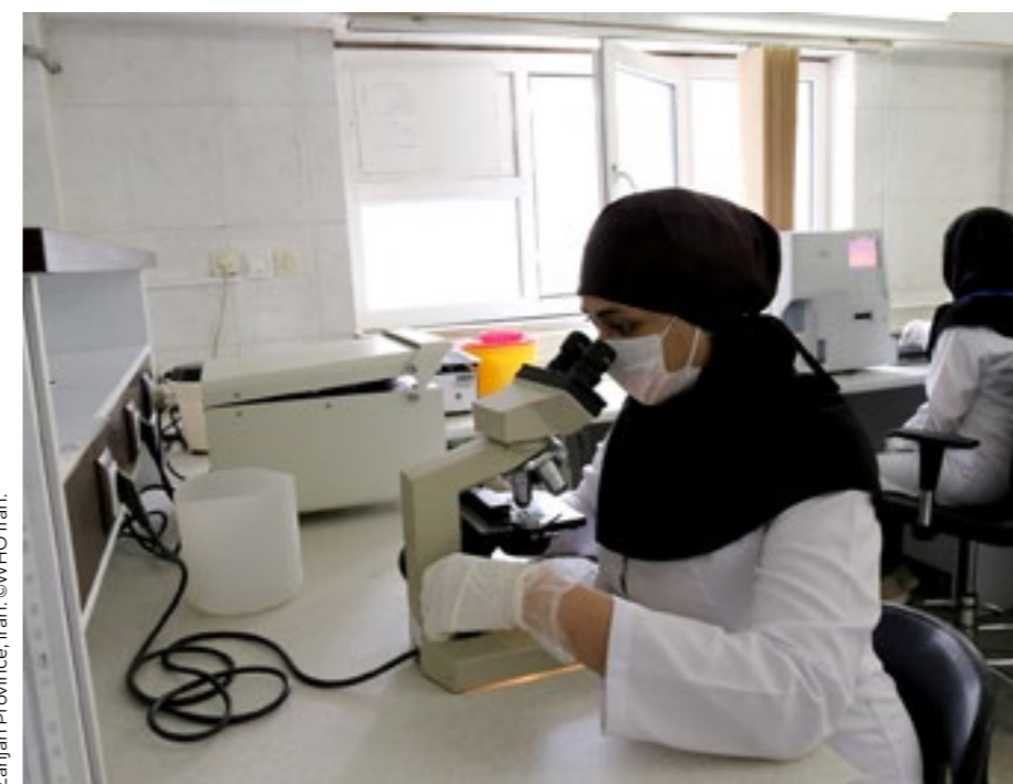
Female lab technicians working at Zanjan Urban Comprehensive Health Center, Zanjan Province, Iran.