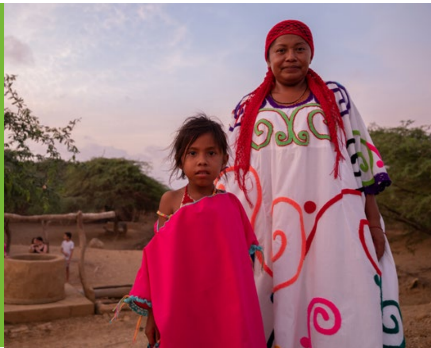
Wayúu woman and girl in Alta Guajira, Colombia.