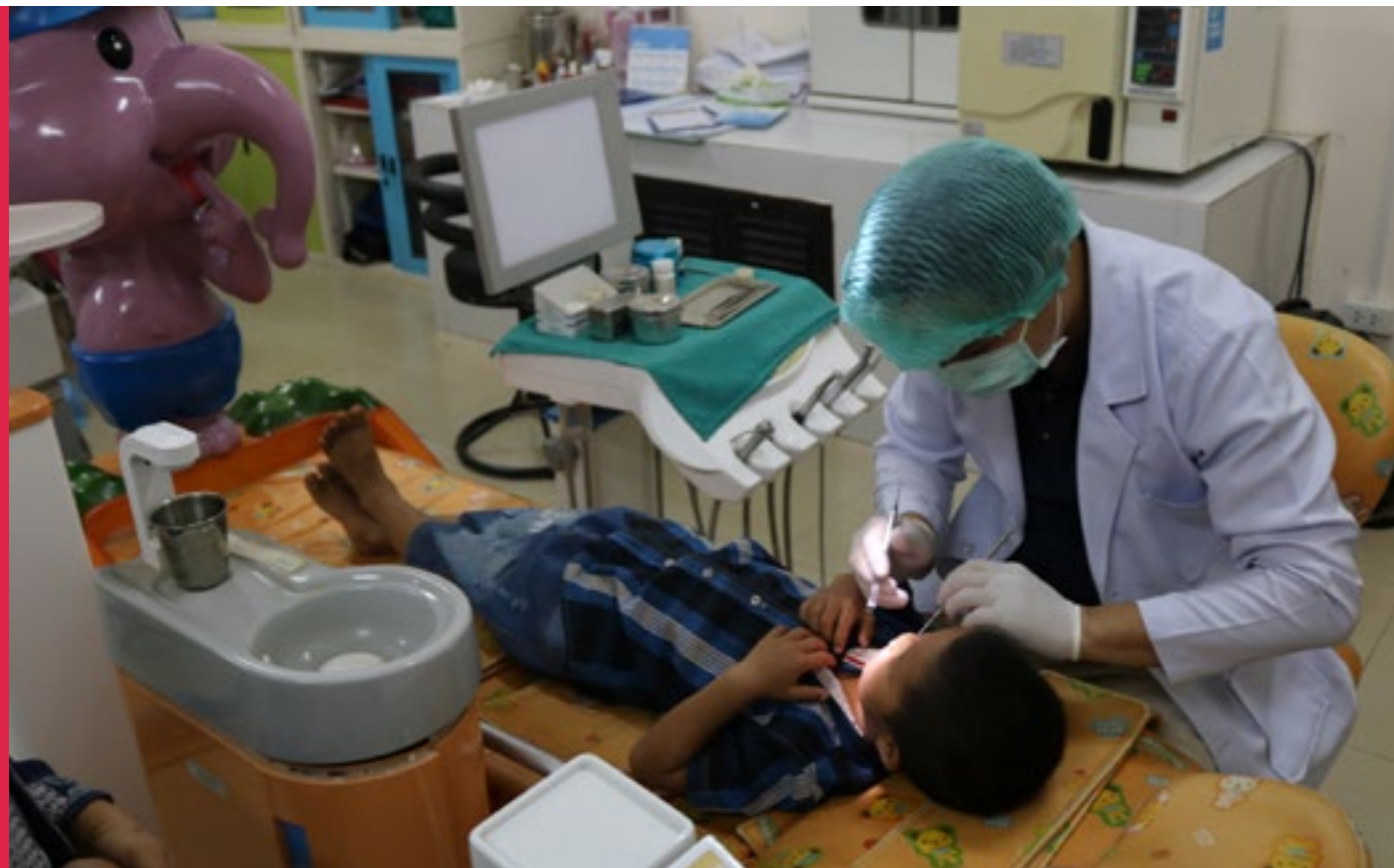
The Children’s Hospital provides a full range of services from primary care / family doctor consultations on minor illnesses, to pediatric surgery and intensive care. It also offers child-friendly dental services.

WHO, through the UHC Partnership, supported the Ministry of Health to reform the health sector and make progress towards UHC, with a focus on strengthening the regulatory system for human resources for health.