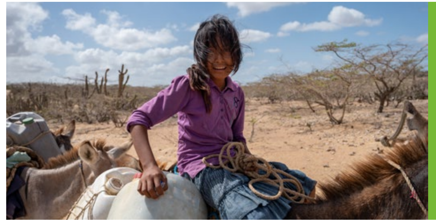
A young Wayuu lady collects water to take to her community.

COVID-19 has spread across Colombia but there is still an opportunity to prevent widespread transmission in areas like the Alta Guajira desert, a remote region inhabited by the some of the most vulnerable communities in the country. Determined to protect them from the pandemic, the Government is enhancing access to primary health care that respects indigenous culture and traditions. Learn how Colombia is taking action to better protect its populations against COVID-19.