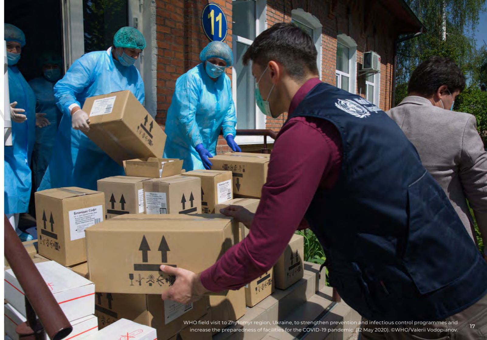
WHO field visit to Zhytomyr region, Ukraine, to strengthen prevention and infectious control programmes and increase the preparedness of facilities for the COVID-19 pandemic. (12 May 2020).