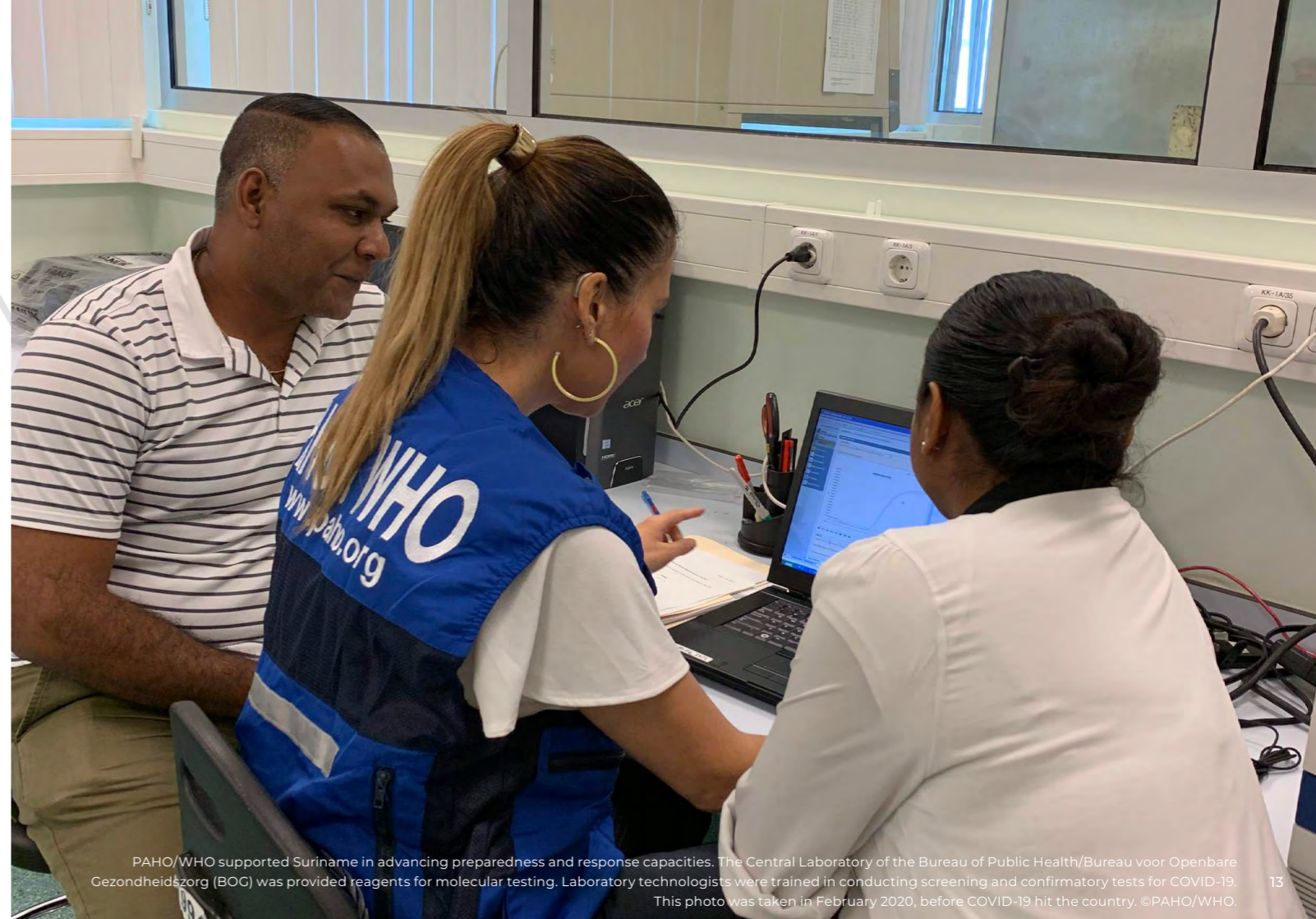
PAHO/WHO supported Suriname in advancing preparedness and response capacities. The Central Laboratory of the Bureau of Public Health/Bureau voor Openbare Gezondheidszorg (BOG) was provided reagents for molecular testing. Laboratory technologists were trained in conducting screening and confirmatory tests for COVID-19. This photo was taken in February 2020, before COVID-19 hit the country.