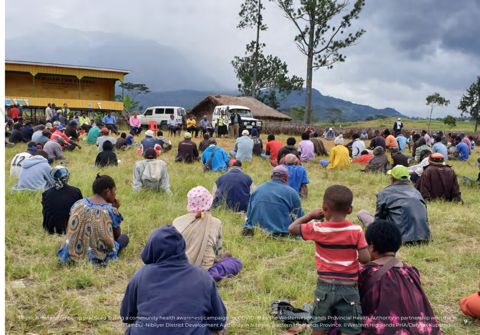
Physical distancing being practiced during a community health awareness campaign for COVID-19 by the Western Highlands Provincial Health Authority in partnership with the Tambul-Nibilyer District Development Authority in Nibilyer, Western Highlands Province.

Raising awareness of COVID-19 and maintaining essential health services through primary health care approaches will help protect the whole population during the pandemic and beyond.