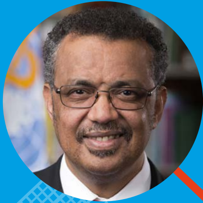
DR TEDROS ADHANOM GHEBREYESUS