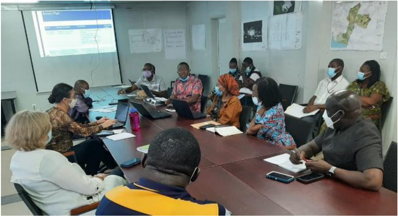
Key stakeholders debrief (WHO, US CDC, USAID, IOM, Hon Minister for Health, MoA); 7 May 2021