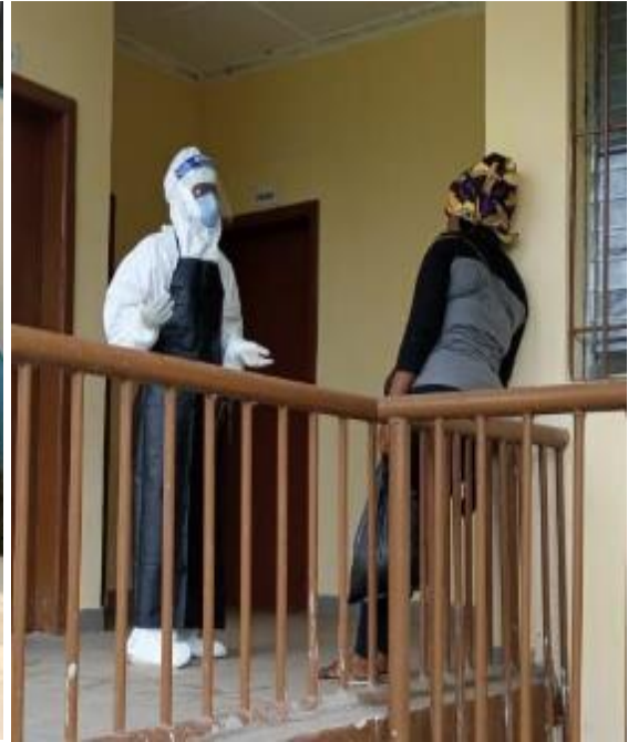
Ambulance with SimEx patient at Phebe Isolation unit (R), Patient received by attending doctor at the isolation unit (L)