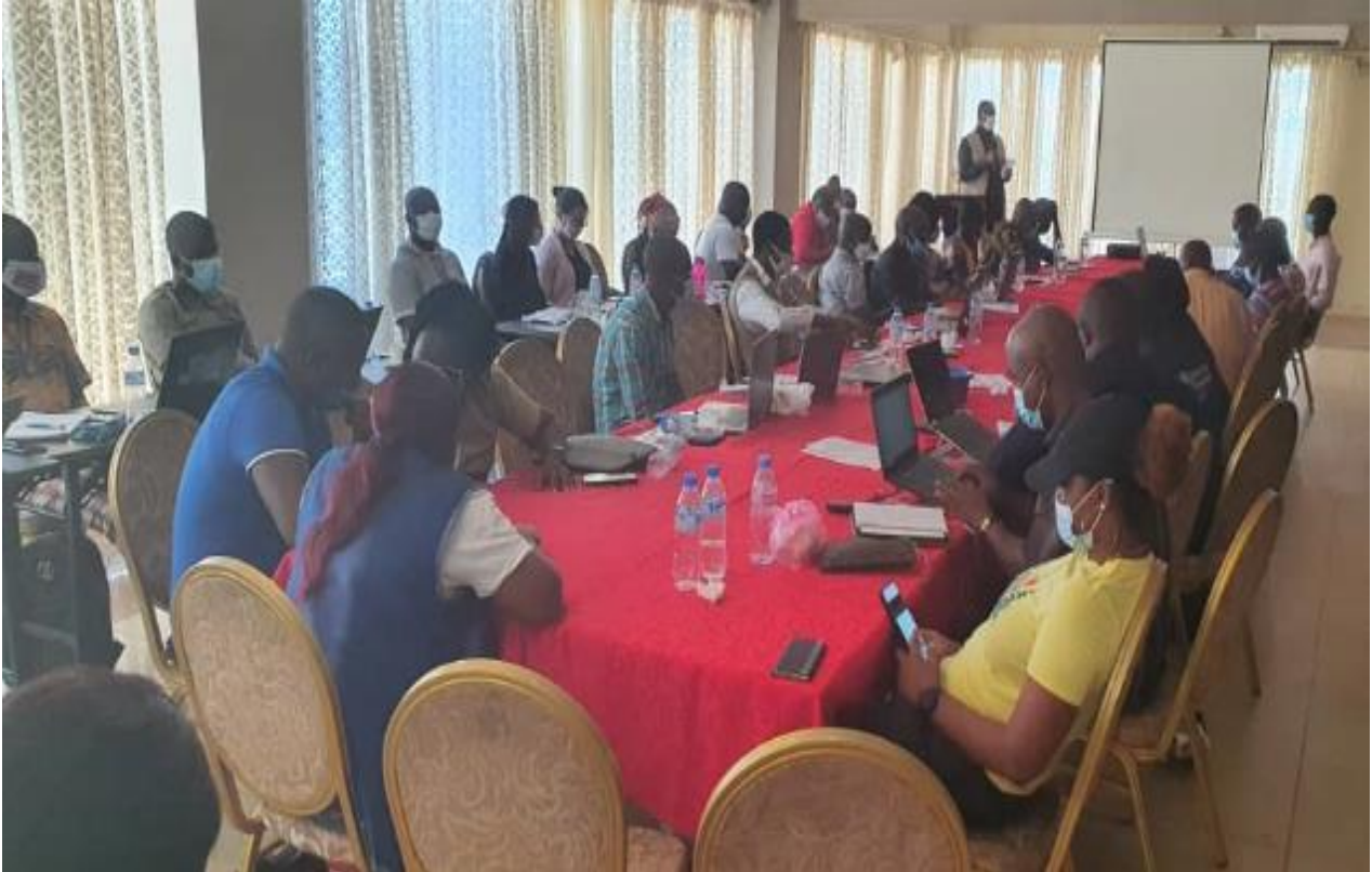
National SimEx debrief session held at CORINA Hotel-Monrovia on 1 May 2021

At the end of the one day debrief, there was general understanding of the EVD readiness status in Lofa, Bong and Nimba counties as well the national level readiness status.