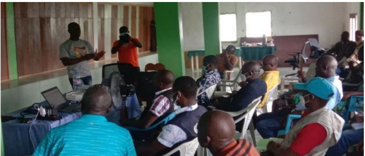
Lofa County debrief meeting 30 May 2021