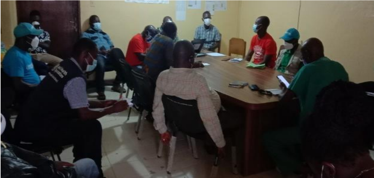
Lofa county debrief meeting 29 April 2021

The debrief session in Lofa county was attended by participants from the CHT, DHTs, Teleweyan Hospital staff, County and district authorities, the media and national facilitators. Key highlighted was many PoEs have no health workers posted, many new RRT team members that require orientation on their roles, inadequate IPC supplies, weak CEBS, IDSR tools at Health facilities and PoEs, logistical supplies for surveillance officers, challenging telephone and road network.