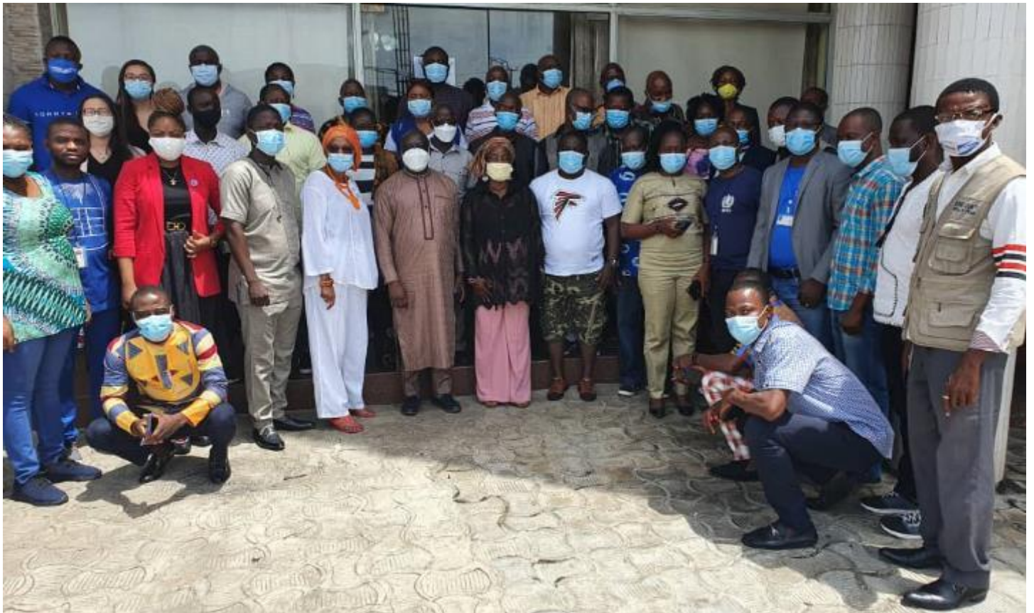
Group picture at the national debrief meeting 1 May 2021