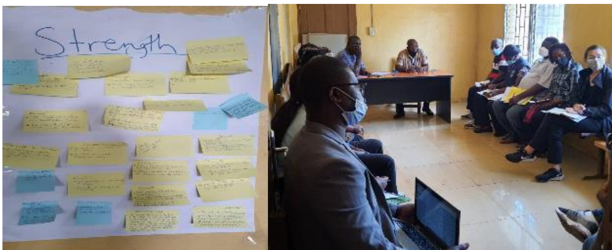
SimEx debrief in Nimba county (process and debrief session) 30 April 2021

There was delay in case detection at the health facility. There is need to conduct orientation for new clinicians EVD case definitions, community health workers on the simplified (community) case definition as well as provision of IDSR reporting tools. Inadequate Water supply, IPC supplies, thermos cans, waste management were key challenges for both health facilities and PoEs