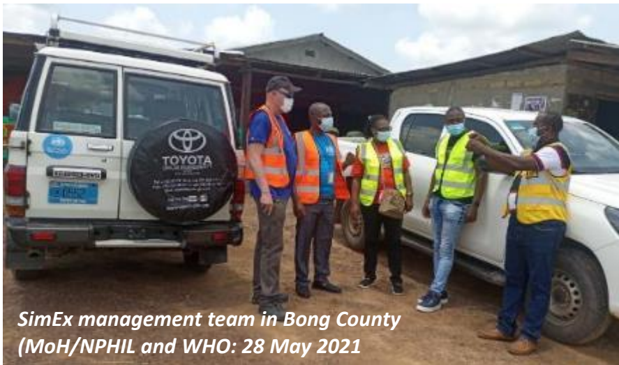
SimEx management team in Bong County

The 3 days SIMEX was held in Lofa, Bong and Nimba Counties, with the national PHEOC providing oversight control of the exercise. Participants included IPC, Surveillance, Point of Entry (POE), case management, laboratory and Risk Communication & Community Engagement (RCCE) pillars. The WHO country office provided both technical and financial support for this activity.