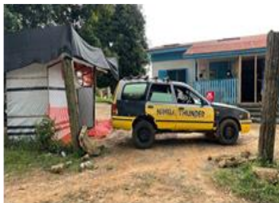
Triage at Yekepa PoE in Nimba County