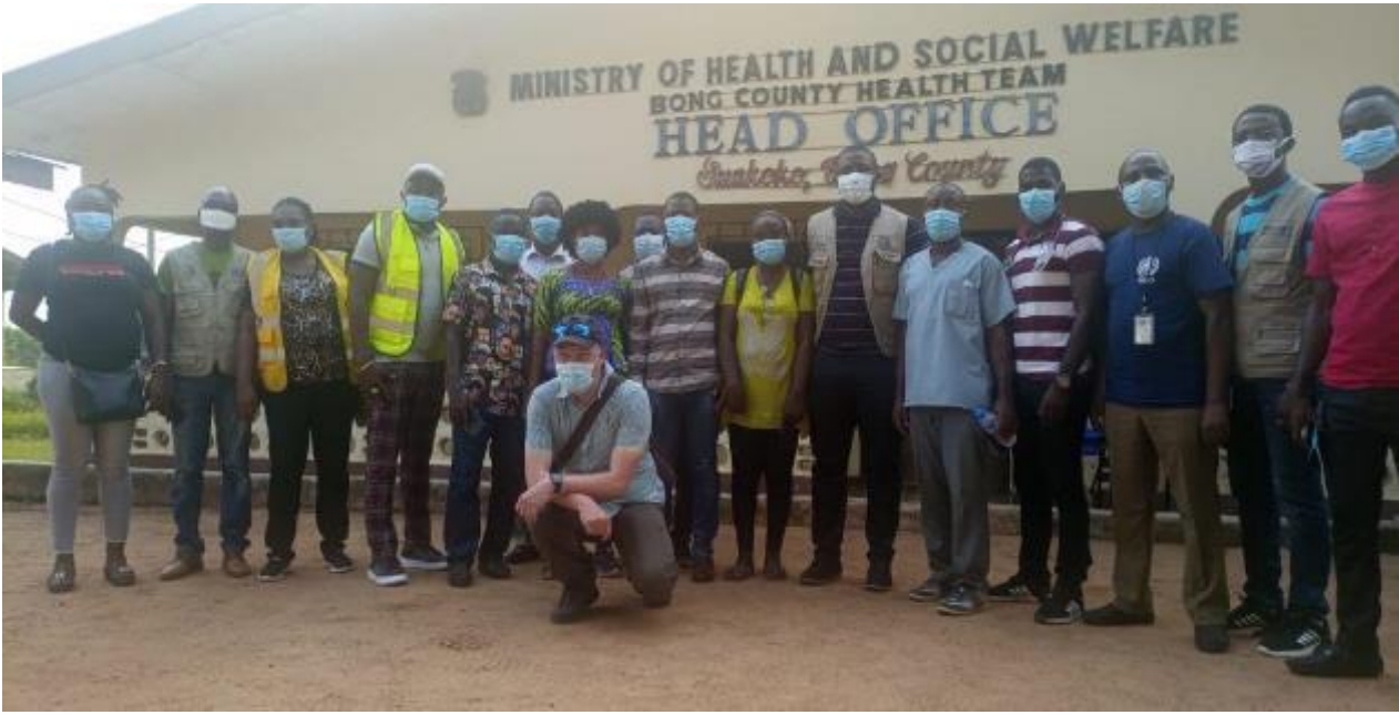
Bong SimEx team 29 May 2021