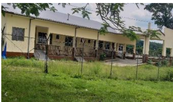
Isolation Unit-Phebe hospital, Bong County