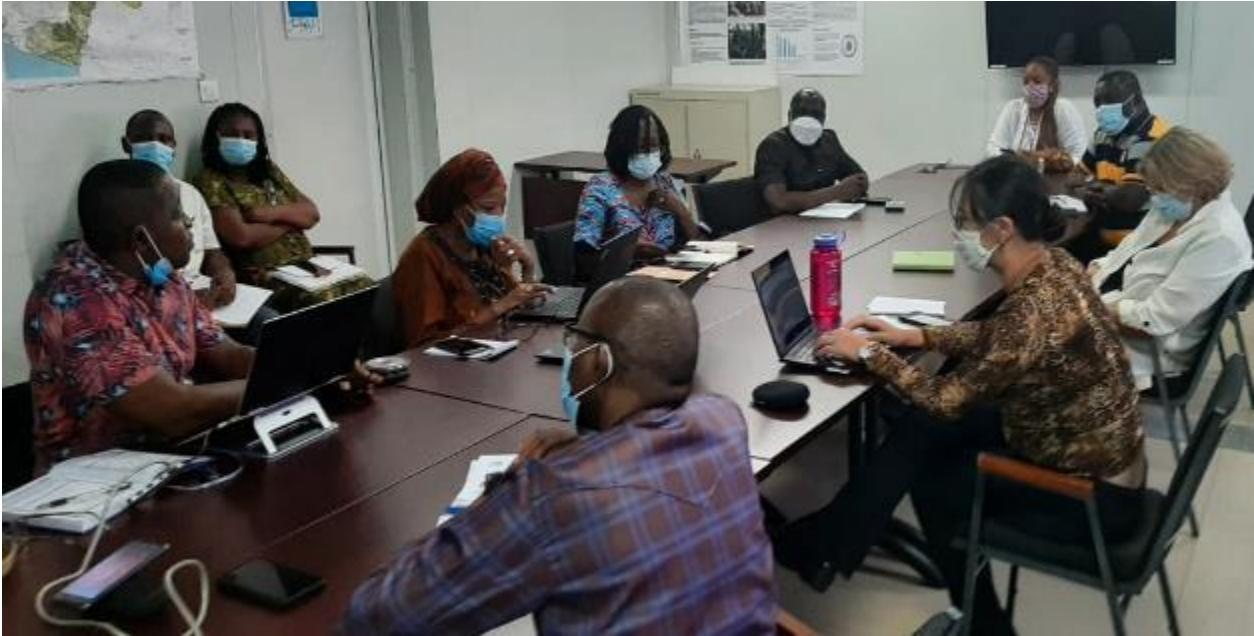
Key stakeholders meeting post EVD SimEx: 7 May 2021