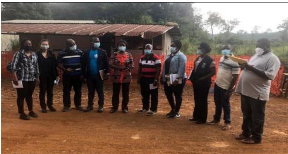
SimEx team (MoH, NPHIL representative, National Reference Lab WHO, US-CDC, and CHT) at one of the PoEs in Nimba County 28 April 2021.