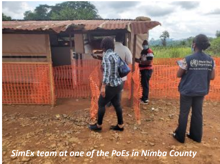
SimEx team at one of the PoEs in Nimba County

The exercise was convened by the National Public Health Institute of Liberia with technical and financial support from WHO, US-CDC and rolled out in Lofa, Bong and Nimba counties prioritized PoEs and referral hospitals. Prior to the conduct of this exercise, consultative meetings were held with the exercise management team to ensure adequate preparation.