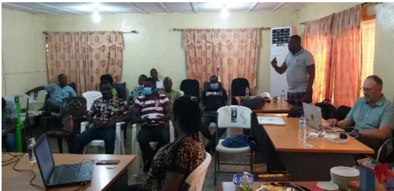
Bong County debrief session 29 April 2021.

The meeting emphasized the need to ensure that all required adequate IPC supplies are deployed at all levels of health care delivery system with monitoring framework in place; strengthening the referral pathway through the provision of designated response ambulance and ensuring all reference documents, SOPs, IDSR reporting tools and guidelines for case detection, case referral and management are available at service delivery points and PoEs.