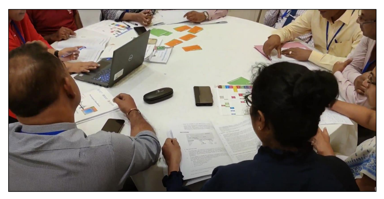
Figure 3: Participants extracting results from the PVS and JEE reports.

The matrix was used to link the identified gaps to their relevant indicators in the IHR MEF and in the PVS Pathway. Each working group then opened the assessment reports (JEE, PVS Evaluation) and extracted the main findings and recommendations relevant to their technical area (Figure 3).