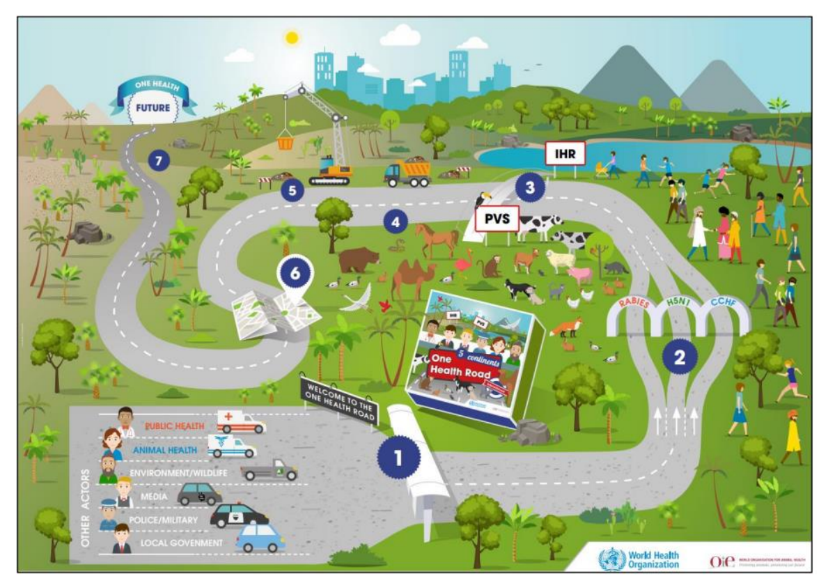
The NBW road poster illustrates the process, with actors from relevant sectors coming together to embark on 7 sessions that lead to the development of a joint NBW Roadmap

The agenda of the Workshop is available in Annex 1.