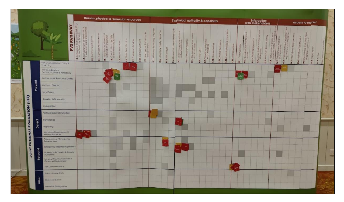
<u>Figure 2:</u> Mapping of the gaps by positioning the selected cards from all groups on the IHR-PVS matrix provides a snapshot of the status of collaboration across technical areas in the country

Through an interactive approach, working groups were invited to plot their technical area cards onto the matrix by matching them to their corresponding indicators. A plenary analysis of the outcome showed clear gap clusters and illustrated that most gaps were not disease-specific but systemic.