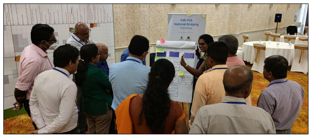
<u>Figure 5:</u> A world café session was organized during which participants rotated through each group to provide comments and inputs on the different roadmap sections