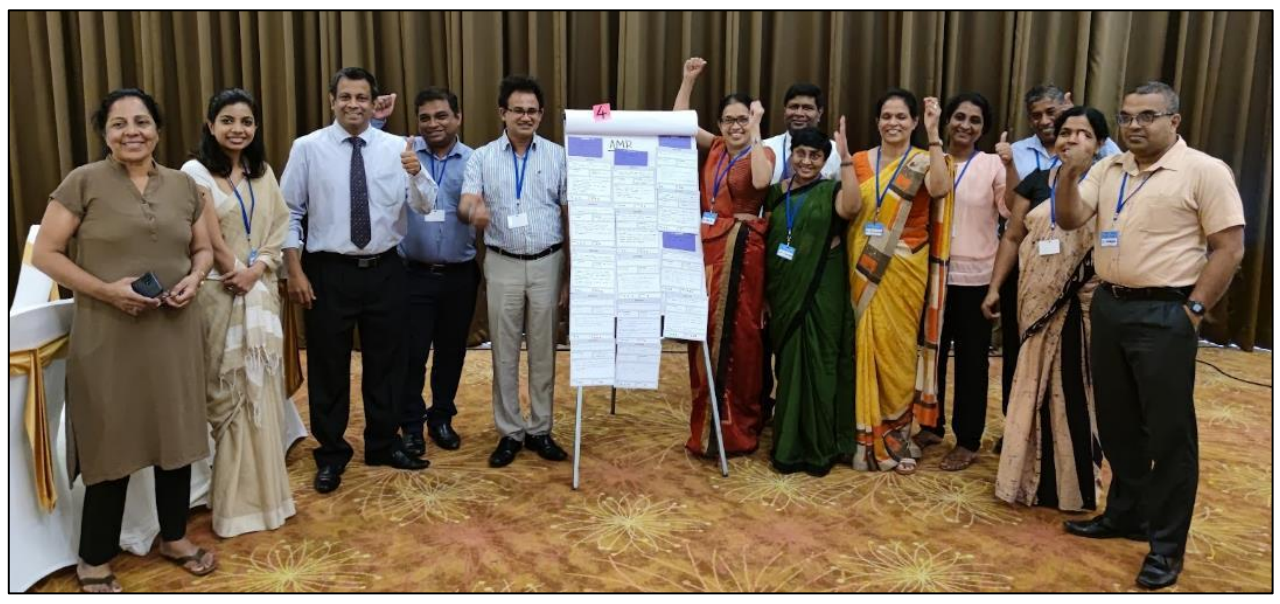
<u>Figure 4</u>: The group working on "AMR" used the results of the previous sessions to identify joint activities to improve the collaboration between the sectors in this domain.

-and most importantly, the experiences of all the participants working on daily basis in the human health, veterinary and environmental health sectors of Sri Lanka.