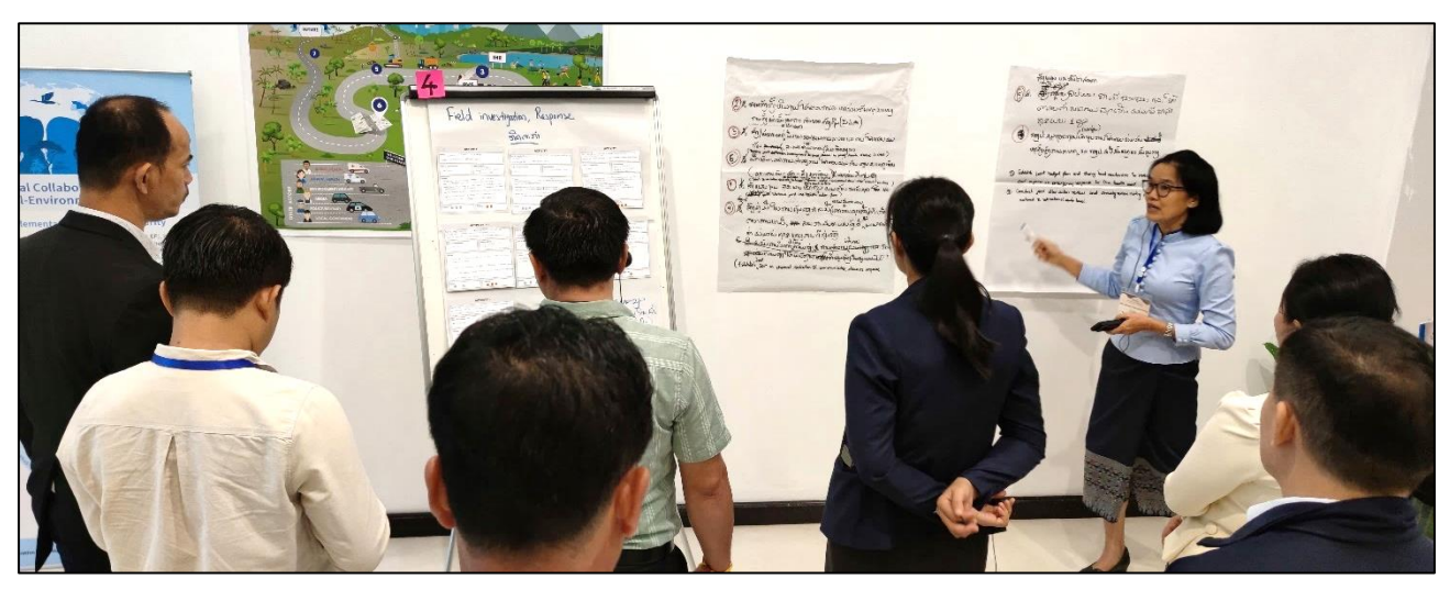
<u>Figure 4:</u> A world café session is organized, during which participants rotate through each group to provide comments and inputs on the different roadmap sections

Overall, the groups identified a total of 9 key objectives and 24 activities. The detailed results are presented in <u>Output 2</u>.