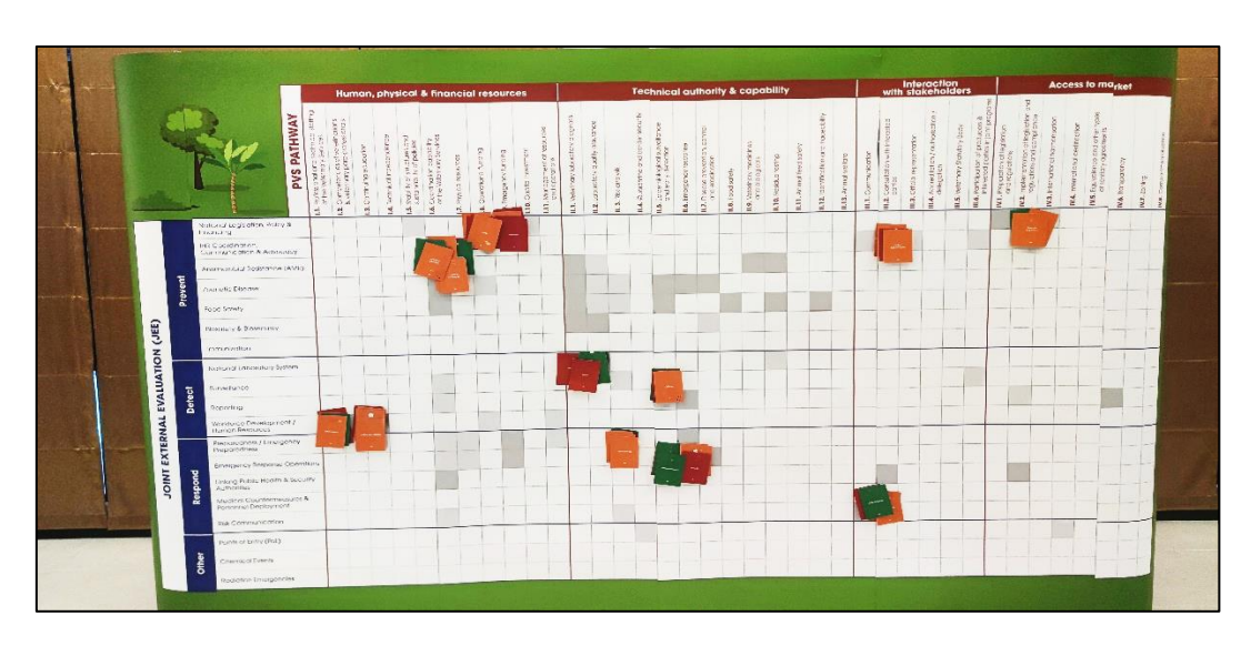
<u>Figure 2</u>: Mapping of the gaps by positioning the selected cards from all scenario groups on the IHR-PVS matrix provides a snapshot of the strengths and weaknesses in the collaboration between the three sectors across all technical areas

Through an interactive approach, working groups were invited to plot their technical area cards onto the matrix by matching them to their corresponding indicators. A plenary analysis of the outcome showed clear gap clusters and illustrated that most gaps were not disease-specific but systemic.