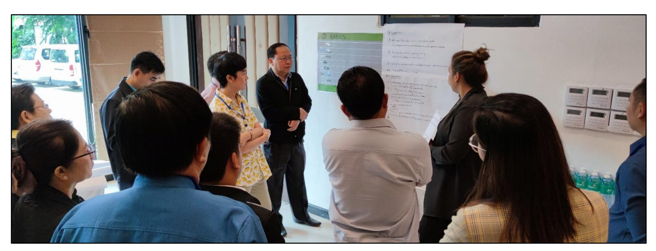
<u>Figure 3</u>: The technical working group on "Surveillance, Laboratory and Risk Assessment" is using the results of the previous sessions to identify joint activities to improve the collaboration between the sectors in this domain.