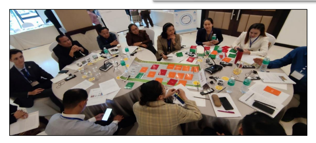
<u>Figure 1</u>: Participants working on a case scenario for river ecosystem collapse are evaluating the level of collaboration between the three sectors for 15 key technical areas.

During an ensuing plenary session, each group presented and justified the results of their work. <u>Output</u> <u>1</u> summarizes the results from each disease group.