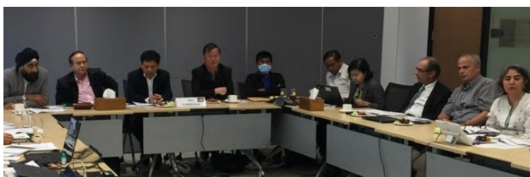
Participants at the coordination meeting

Operation Center (EOC) and Integrated Management System (IMS).