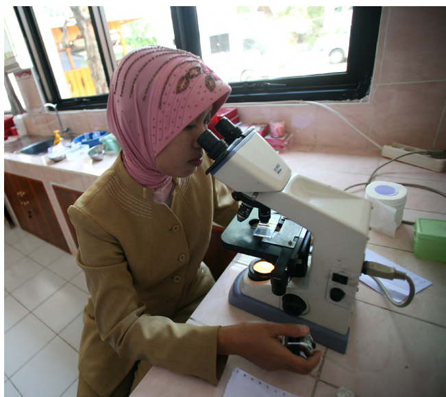
Quality spending ensures supply side readiness at such primary health care facilities and boosts efforts to achieve UHC.

Analytics and I-SPHERE Project impacting health spending in Indonesia