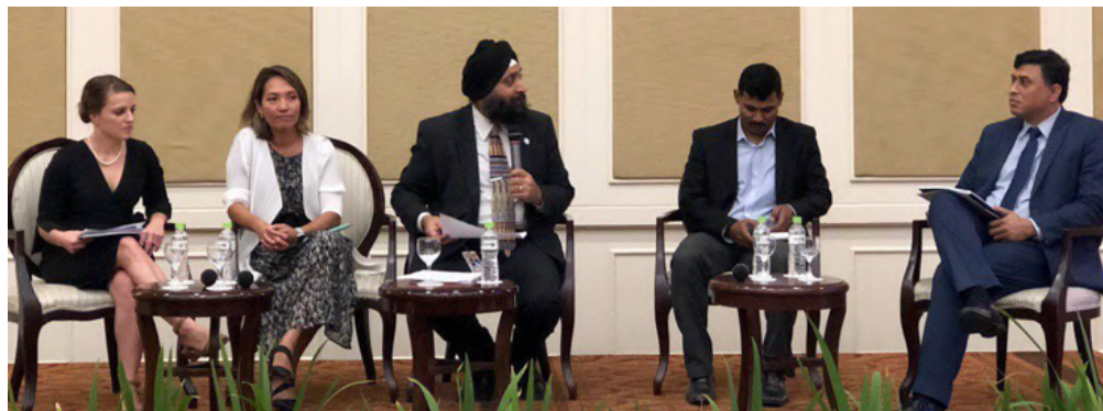
Panelists speaking at the workshop to launch the Cambodia Economic Update.

were included in the selected issue on “Investing in Cambodia’s Future: Early Childhood Health and Nutrition” in the May 2019 Cambodia Economic Update. It found that a third of Cambodia’s future work force is experiencing childhood stunting – a marker of undernutrition and measure of the severity of faltering growth. Stunting is associated with lower cognition and motor development in early childhood and later life learning, health, and ultimately, adult earning potentials. Nearly 10% of Cambodian children are also experiencing child wasting, a form of acute malnutrition, which is considered high.