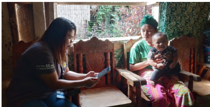
An enumerator interviews a mother in BARMM about her family health situation for the WB-supported household survey.

BARMM has some of the lowest health outcomes in the country, including for immunization, which raises the risk of outbreaks of vaccine-preventable diseases, including polio. Complete polio vaccination coverage in BARMM is low and declining as can be seen in the following table.