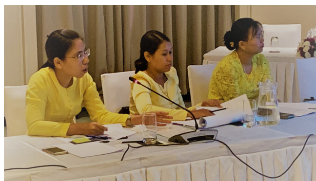
A representative from the Ministry of Planning and Finance speaks at the Introductory Workshop on Health Security Financing in Nay Pyi Taw.