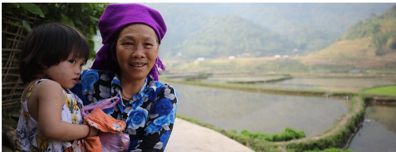
This grandmother and her granddaughter in rural Vietnam will benefit from investment in grassroot health services.

The World Bank Board of Executive Directors has approved a US$80 million credit on June 19 to help Vietnam improve the quality and utilization of its grassroot health services in 13 provinces.