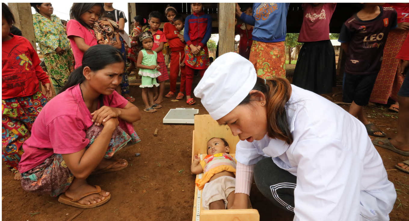
A midwife provides growth monitoring and promotion services to ethnic minority children in rural Cambodia.

Multi-Donor Trust Fund (MDTF) for Integrating Health Programs