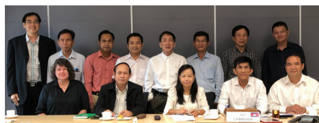
Members of the National Task Force for Health Security Financing at their meeting in Cambodia on June 11, 2019.

The task force includes the National Committee for Disaster Management; Ministry of Health; Ministry of Agriculture, Forestry and Fisheries; Ministry of Economy and Finance; Ministry of Planning; Ministry of National Defense; Ministry of Interior; Ministry of Environment; the World Bank, World Health Organization (WHO), United Nations International Children’s Emergency Fund (UNICEF), Food and Agriculture Organization (FAO), Australia’s Department