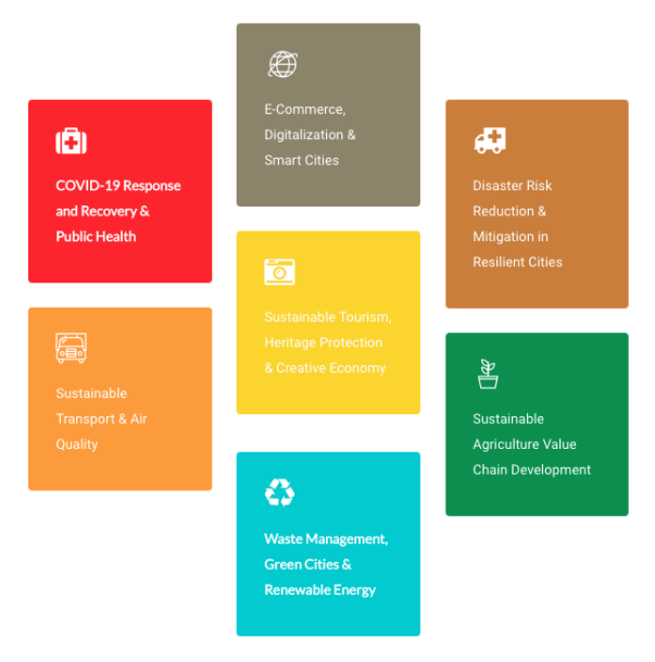
The Cities Project.

In 2017, the United Nations Office for South-South Cooperation (UNOSSC) initiated the SSTC among Maritime-Continental Silk Road Cities for Sustainable Development Project (Cities Project). The Cities Project aims to promote SSTC at the city level, leveraging the thematic expertise of UN specialized agencies and the strategic opportunities offered by the "Belt and Road Initiative" (BRI) in advancing sustainable development globally. The Cities Project aligns its support with the engagement and ownership of local authorities and stakeholders. It is designed to provide streamlined services which include demand-driven needs assessment, capacity development, advisory and advocacy, knowledge, expertise, and technology transfer and implementation and co-financing support to pilots for demonstration purposes.