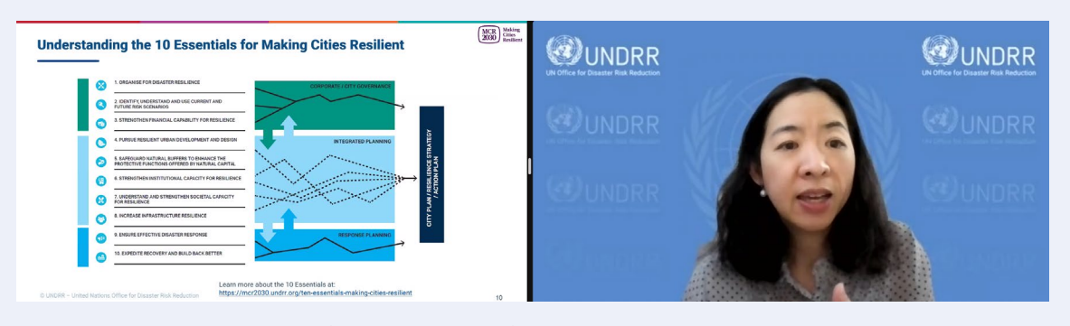
Ms. Pruksapong presenting during Session 2.

Ms. Pruksapong emphasized that a systematic approach must be taken in order to make a city resilient: "When we talk about resilience building, we have to look at not only the emergency preparedness and responses to these acute shocks, but also to take a more integrated angle. We need to get our city development to embed risk information and make sure we reduce the chronic stresses and all underlying factors of the cites at the same time."