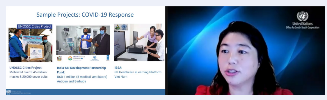
Ms. Wang presenting during Session 1.

She highlighted that peer-to-peer learning can play a significant role in supporting local governments to become resilient: "The ability to share knowledge and apply good practices is crucial for cities to optimize their responses and build resilient futures. The exchange of knowledge, mobilization of expertise and research resources, training, and capacity development are becoming more and more important in the changing world that has been significantly impacted by the pandemic and challenged by complex risks at all levels."