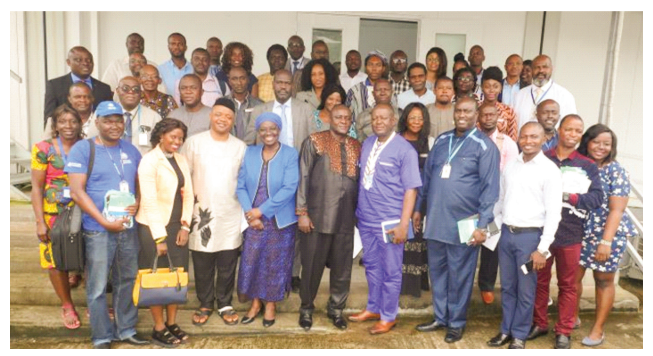
Ministry of Health and Sanitation in collaboration with WHO (AFRO and Country Office) held a NAPHS strategic advocacy engagement meeting with Members of the Parliament Committee on Health

being undertaken to engage communities and exchange information internally and with partners.