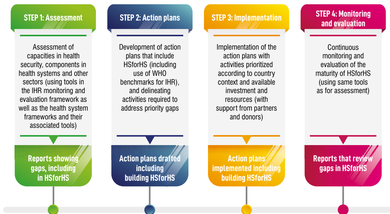
Figure 3. Four steps for building health systems for health security (HSforHS)