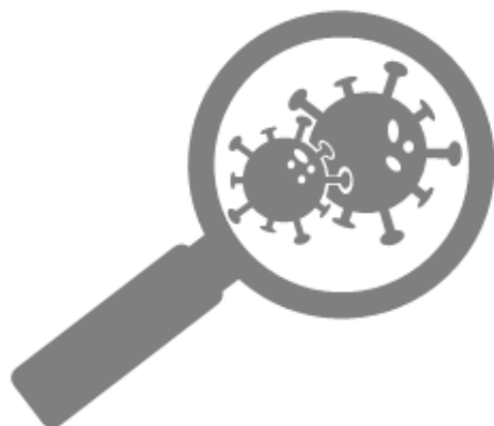
COVID-19 INTRA-ACTION REVIEW