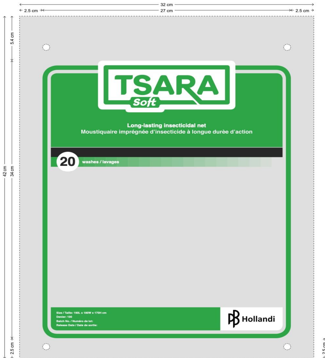
TSARA Soft (NO Flap) - Front side