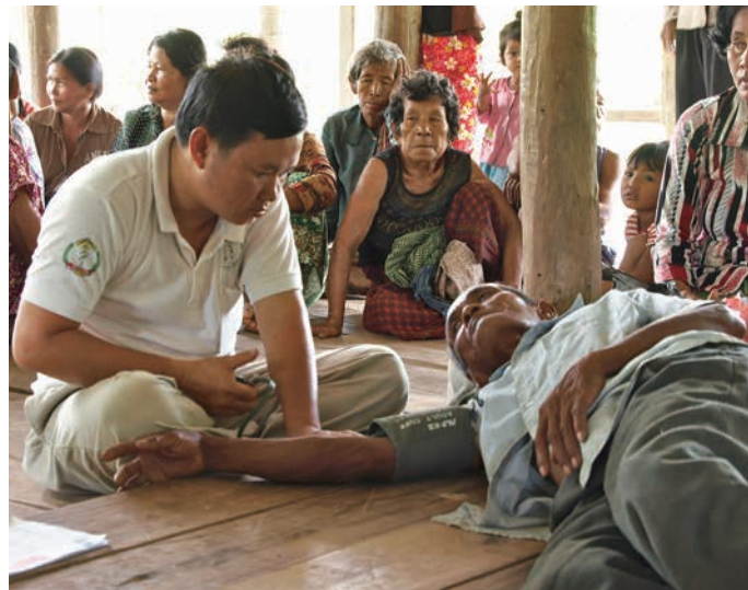
Integrated community-based care for older people in a village in Cambodia