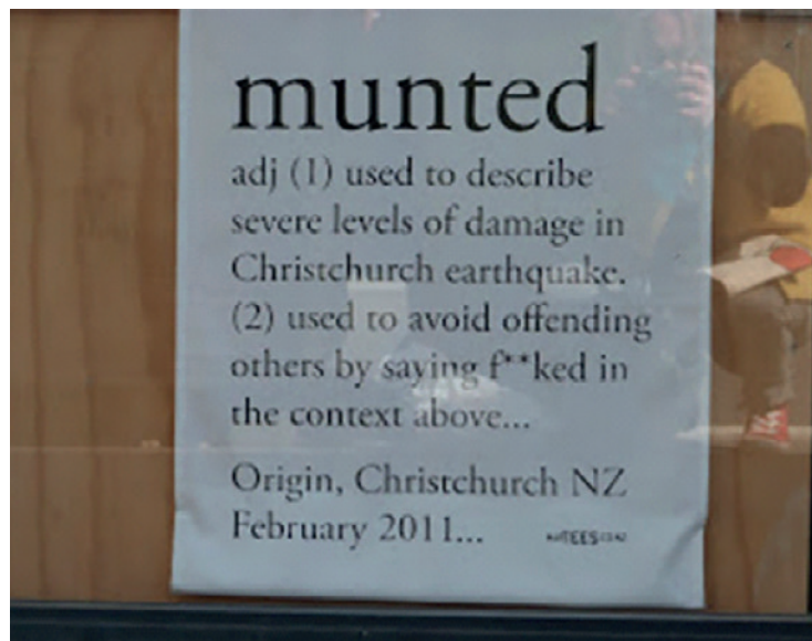
Figure 4.12.1 The creation of a shared language in relation to the Canterbury Earthquakes