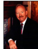
Philip Crosby 1926-2001