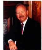
Philip Crosby Four Absolutes of Quality Management 1979