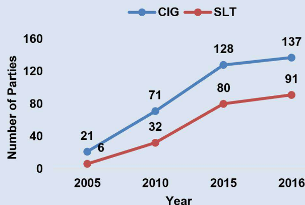
Fig. 1: Progress of Parties in Notifying HWs (≥30%) on Cigarettes (CIG) and SLT