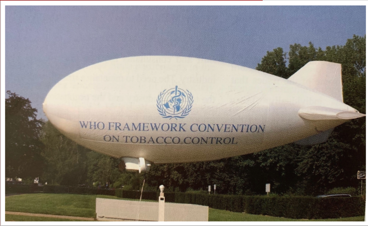
WHO Headquarters, Geneva, 2003