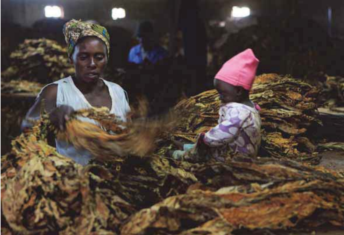
A woman sorts dried tobacco leaves in Harare, Zimbabwe while a child sits nearby.

Northern Tobacco (NT), the company with the second-largest market share of tobacco purchases in Zimbabwe in 2016, included information on the hazards to children of exposure to dust while working in tobacco farming in its 2017 Grower’s Guide on Child Labour in Tobacco Farming. In a section outlining hazards in agriculture, the document states, “Children who work in tobacco production are exposed to dust when preparing the land, weeding, harvesting, curing, grading and transporting tobacco leaves. Respiratory, skin and eye problems such as allergies and asthma, are common reactions.” 81