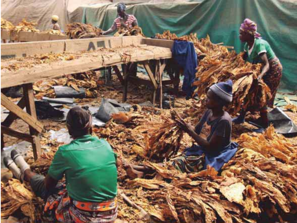
Workers sort dried tobacco leaves on a farm outside of Harare, Zimbabwe.