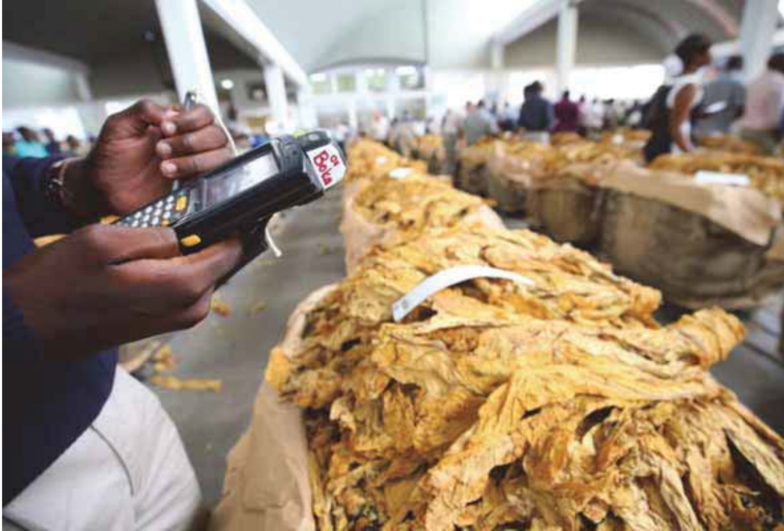
A buyer logs data on the first day of the 2017 tobacco selling season in Harare, Zimbabwe.

best results for all parties involved.” BAT and Imperial stated that they would work to encourage increased transparency within STP. 270