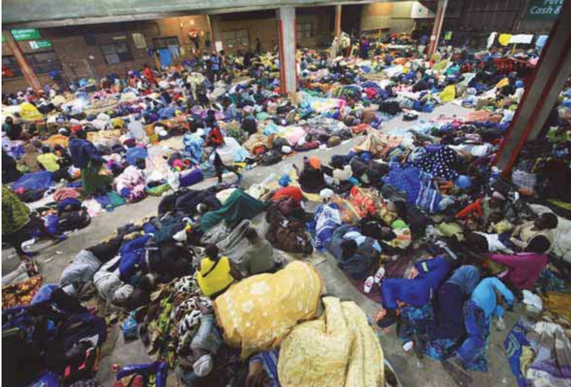
Tobacco farmers sleep in an auction house in Harare, Zimbabwe waiting to sell their tobacco crop to buyers.

Human Rights Watch wrote to 31 tobacco companies, including the eight companies that accounted for 86 percent of the tobacco purchase market share in Zimbabwe in 2016. We also wrote to several companies with whom we had previously corresponded regarding child labor on tobacco farms in other countries. The companies included 12 multinational tobacco companies: Altria Group, Alliance One International (AOI), British American Tobacco (BAT), China National Tobacco Corporation, Intercontinental Leaf Tobacco (ILT), Contraf Nicotex Tobacco GmbH (CNT), Imperial Tobacco (Imperial), Japan Tobacco International (JTI), Rift Valley Corporation/Northern Tobacco (NT), Premium Tobacco Group (Premium)/Premium Tobacco Zimbabwe (PTZ), Philip Morris International (PMI) and Universal Corporation (Universal); and three Zimbabwean tobacco leaf merchant companies: Boostafrica Traders (Boostafrica), Chidziva Tobacco Processors (Chidziva), and Curverid Tobacco Limited (Curverid). We did not contact other Zimbabwean companies with smaller market shares.