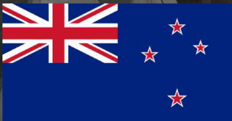
Ministry of Foreign Affairs and Trade, New Zealand