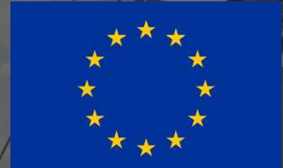
European Union (DG ECHO)