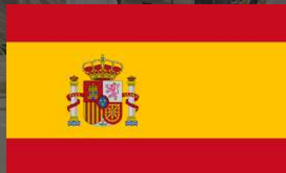
Spanish Cooperation Agency for International Development