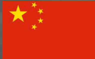
Special Administrative Region of Macao, China