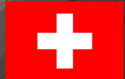
Swiss Agency for Development and Cooperation