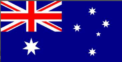
Department of Health, Department of Foreign Affairs and Trade, Northern Territory Australia