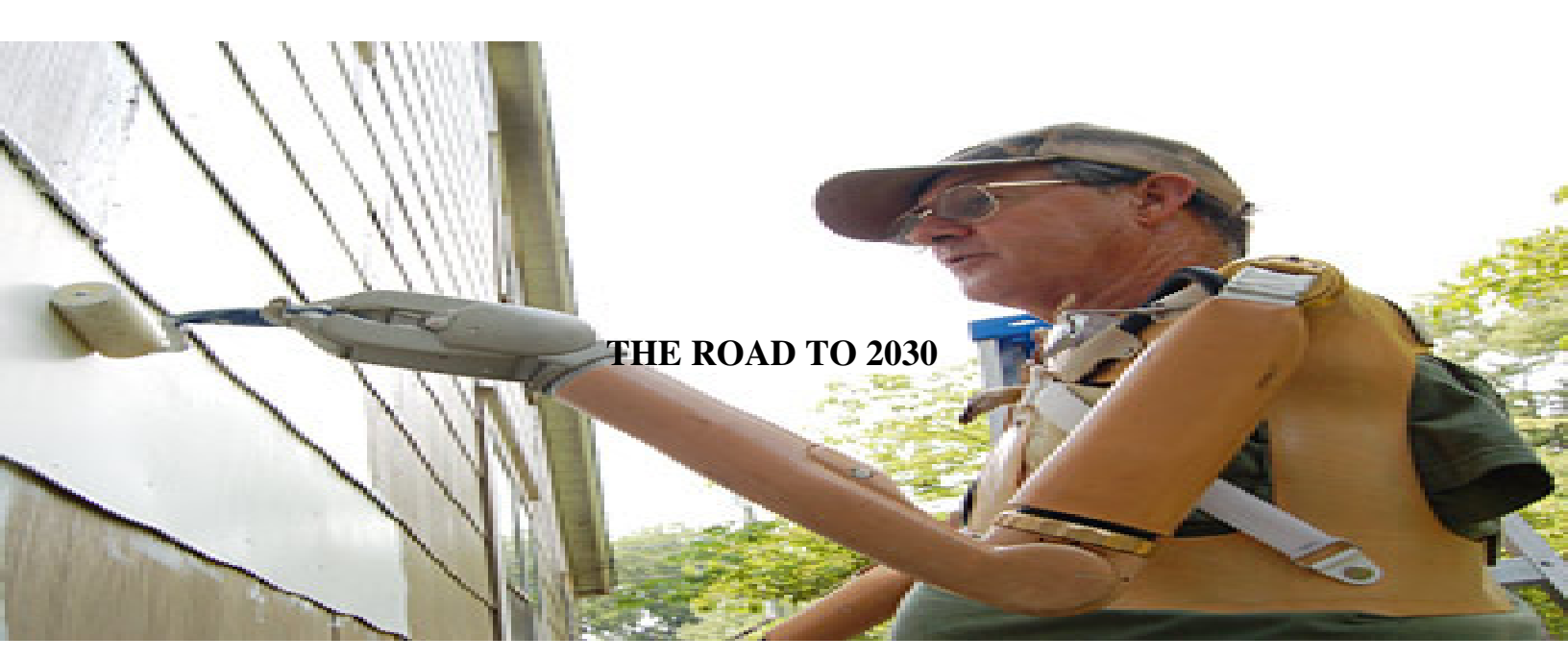
The Goal Standard

As Jamaica posits the goal of developed country status, the question as to what exactly is a developed country arises. The goal standard towards which the country must strive has to be defined, supported by a sound philosophical framework and programmatic strategies. This should be considered in the context of what it means for our health sector.