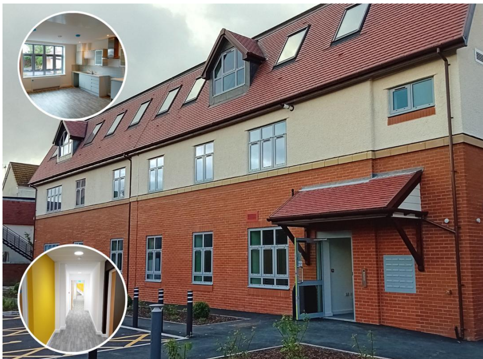
Llys Elizabeth Apartments, Rhyl

All social or community housing is administered through a process known as SARTH (Single Access Route to Housing), whereby applicants make a single application for housing which is then assessed by the Denbighshire Housing Register Team, who will allocate the applicant into one of four priority bands.