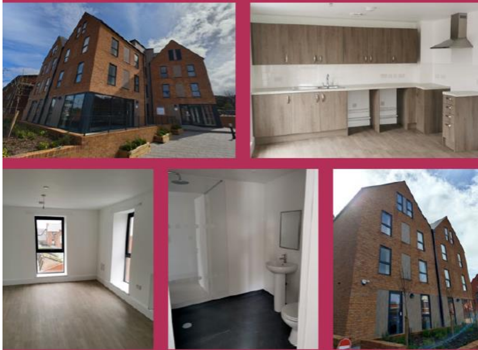
Llys Lien apartments - Prestatyn