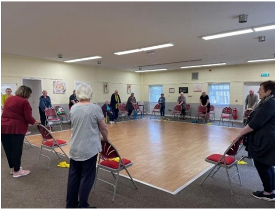
Seated exercise Class - Prestatyn

well as regular outdoor activity sessions. A large proportion of the clients are over 60 years of age.