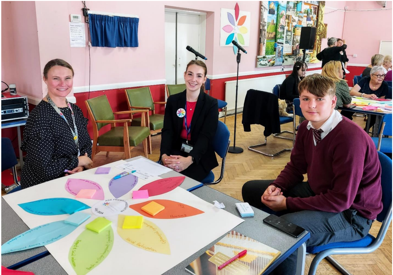
Students from Prestatyn High school have been working with tenants from Nant y Mor Extra Care Housing scheme for more than a decade on a variety of innovative projects.