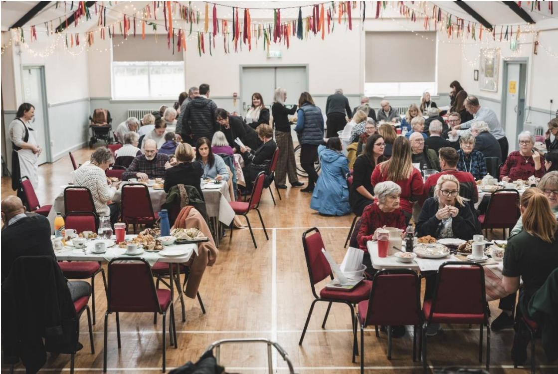
One of our age-friendly engagement events, February, 2024.