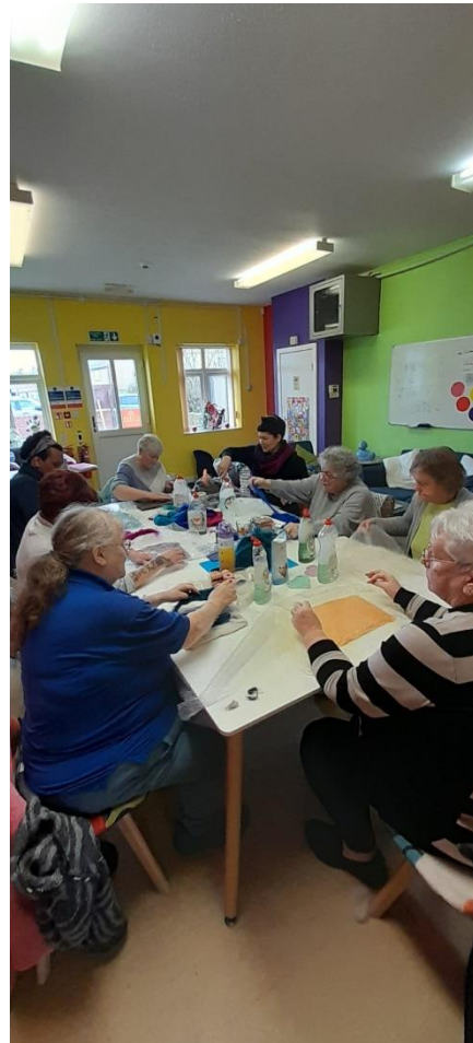
Felting Craft Session - Rhyl