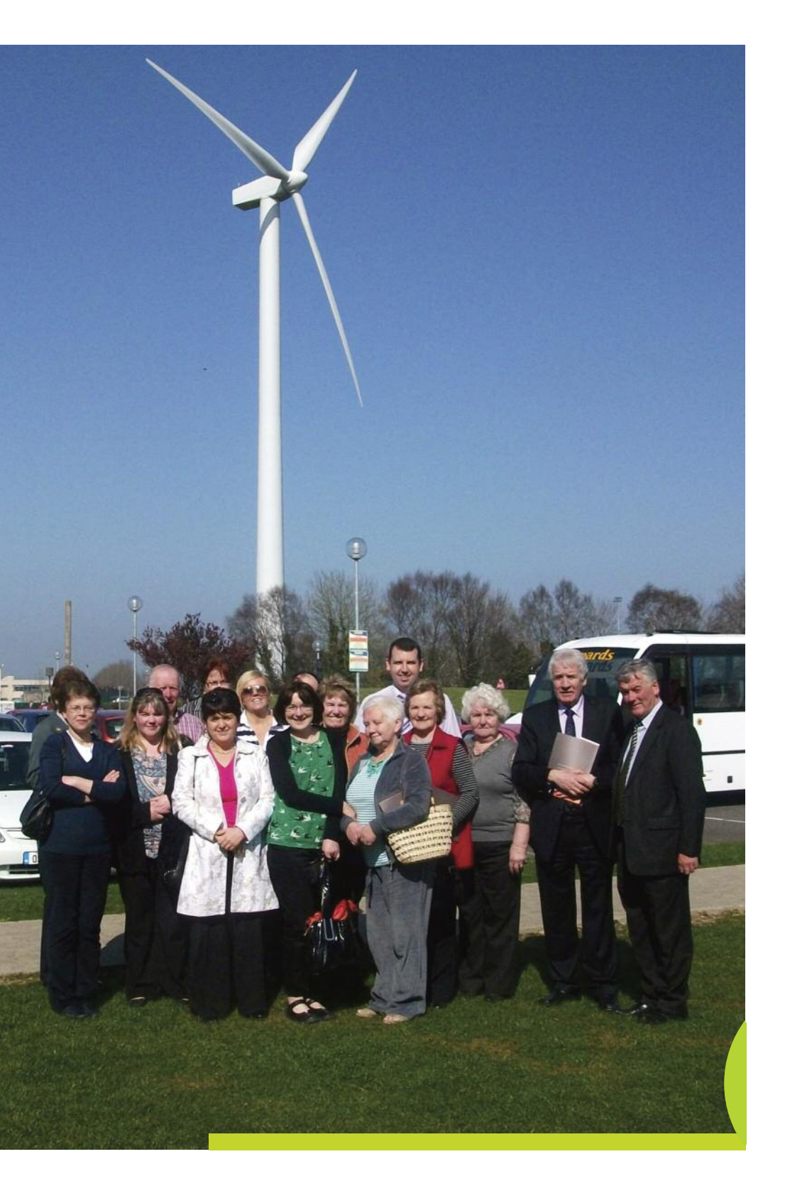
Members of Monaghan's SPC and Older People's Forum receive an unforgettable tour of the age-friendly projects rolling out in County Louth. Visit kindly hosted by our friends and colleagues in the Netwell Centre at DkIT.