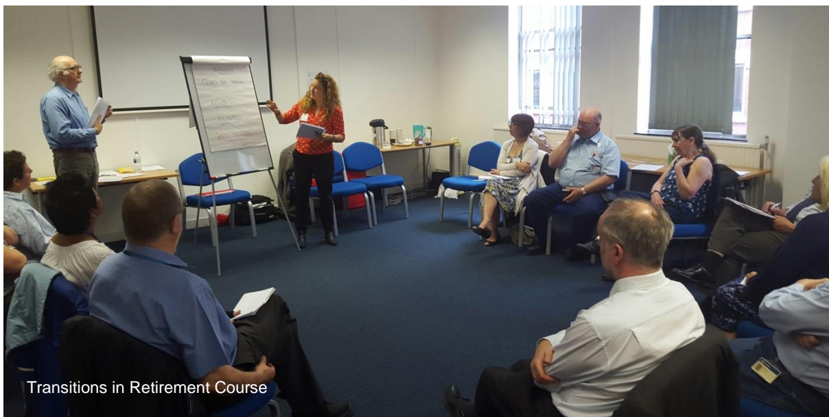
Transitions in Retirement Course

A total of 37 people attended the course and feedback was generally very good. The exit feedback questionnaire clearly shows that different people connected with different aspects of the course; some the storytelling, some the reflection, some the coaching techniques and some the opportunities to work/volunteer. There was no clear favourite activity, suggesting the value of including a range of activities and approaches in enabling everyone to benefit. The activities varied in length, approach, pace and structure and this worked well at keeping people energised, engaged and curious.