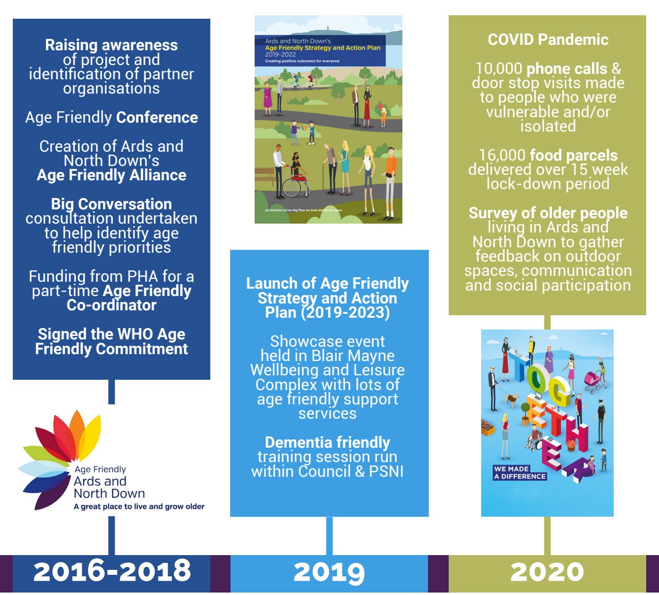
Figure 2: Age Friendly Highlights

Highlights from Age Friendly activities are shown in figure 2.