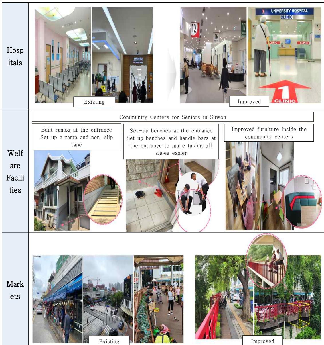
〈Figure 2〉 Examples of changes to the external environment and improvements in welfare facilities