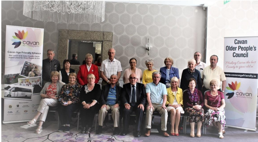
Newly elected Cavan Older People's Council Executive at the AGM in June 2019. The committee retained many existing members and welcomed some new members