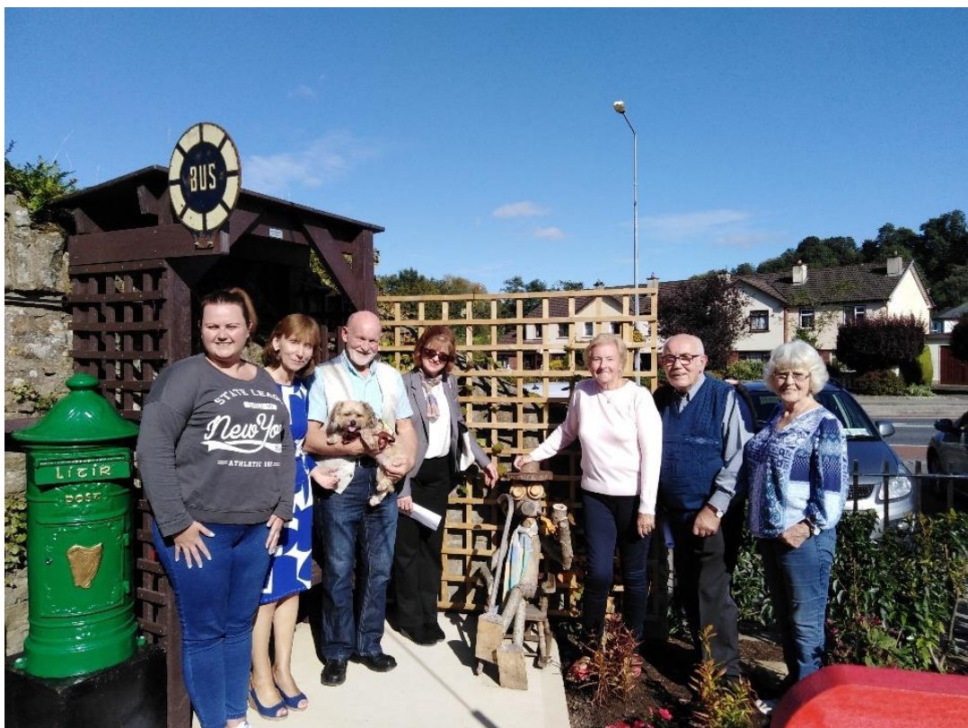
Cavan Dementia Friendly Garden won an award at the National Age Friendly Recognition & Awards Ceremony in 2019 for their Dementia Friendly Garden.