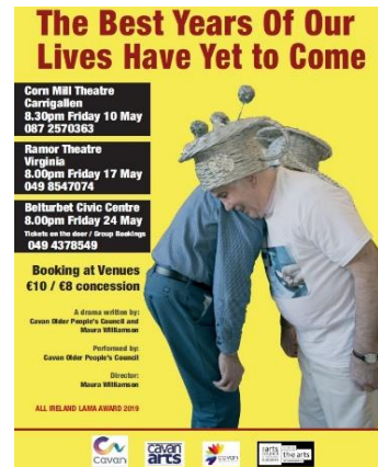
The Award Wining OPC Drama Production 'The Best Years of Our Life Have Yet to Come'