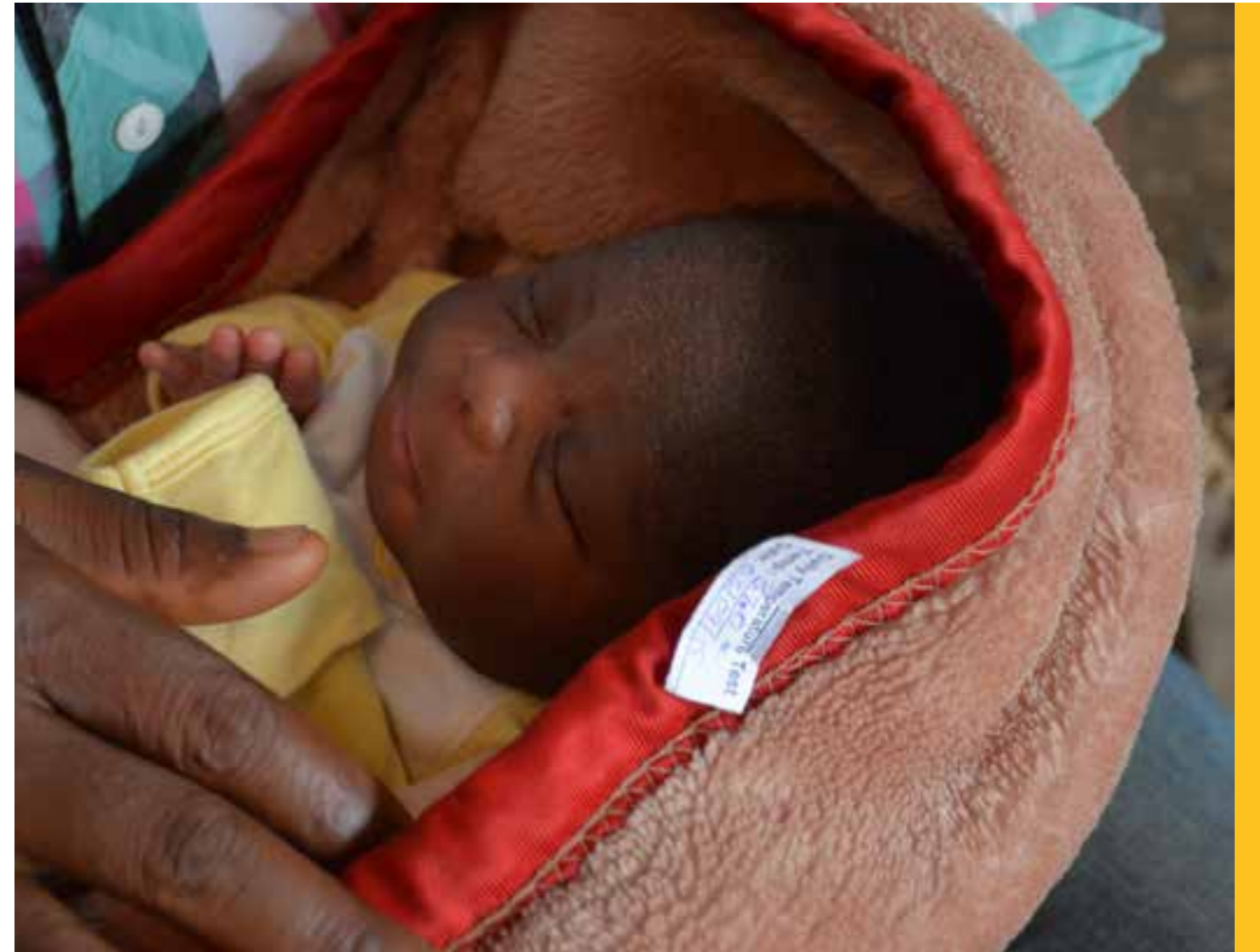
A new born baby in Monrovia, Liberia

The nurses and midwives are being trained to far higher levels than usual in obstetric and neonatal care in what is known as ‘task-sharing’ with other medical professionals. Why is this so important? Maternal and newborn deaths in Liberia are tragically all too frequent. Every day, an event claims the lives of four to five mothers and eight to ten newborns and most deaths occur around the perinatal period, immediately before and after birth. Many deaths are due to delays in recognizing a life-threatening emergency at the community level. Other causes are delays reaching a hospital with the right facilities and staff to treat the patient, and delays at hospitals to identify and respond to the emergency. Added to this is the problem of the lack of doctors in Liberia, with only 298 doctors and 16 obstetricians available in a population of about 4.8 million. Nurses, midwives and community birth attendants have the potential to carry out critical medical tasks.