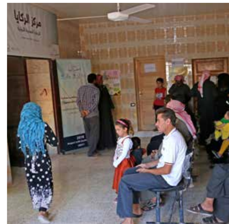
NCD patients waiting to receive care at PHC centre of Maerdaba Idlib northwestern Syria.

Universal health coverage means no one must be left behind, including people living in emergency settings. In the difficult context of a complex humanitarian emergency, it is all the more important for WHO and partners to work together to ensure that the people of the Syrian Arab Republic receive the health care services they need.