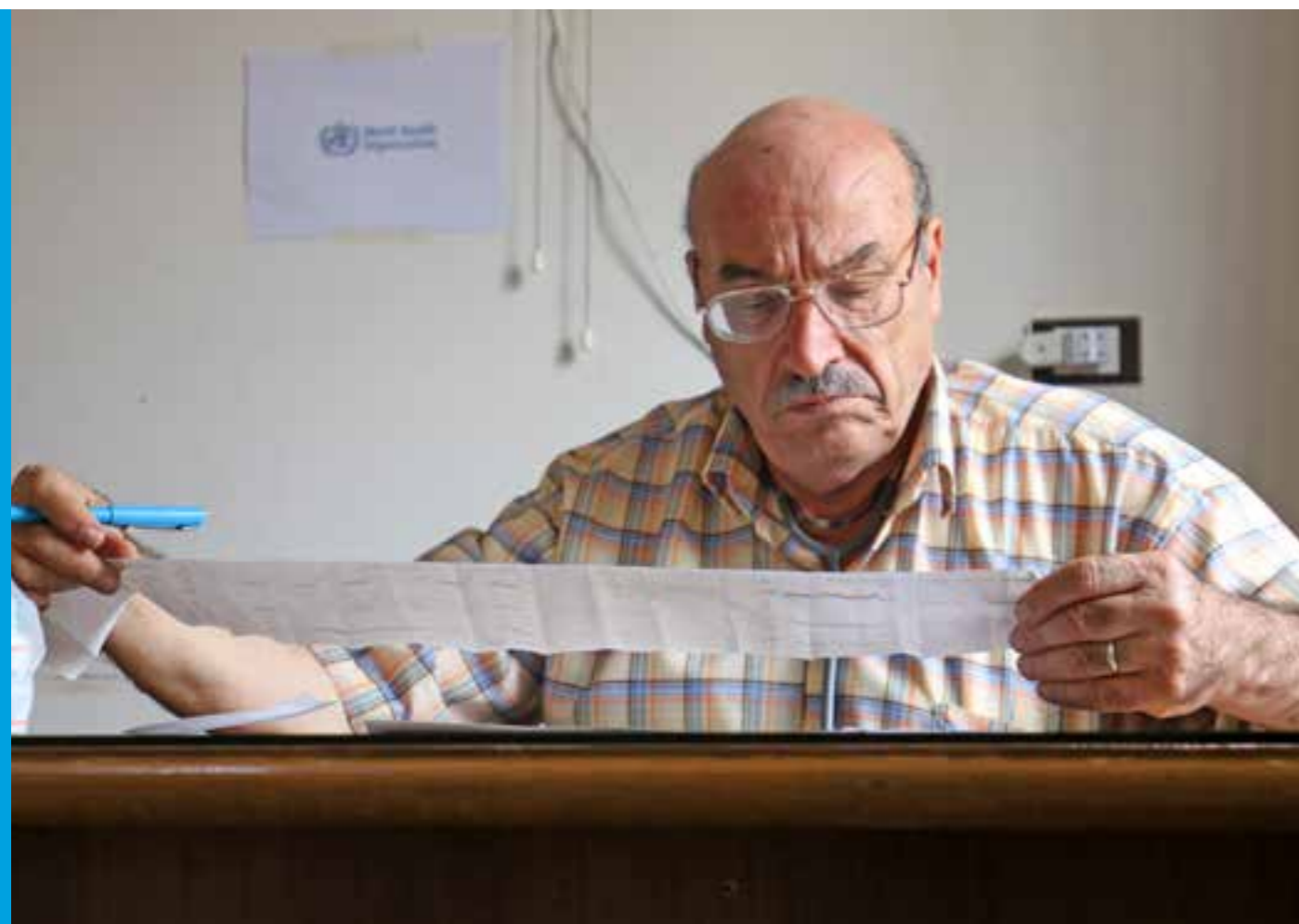
Doctor checks patient test results in PHC in Idlib Northwestern Syria.

Interlinking access to medicines and medical supplies with capacity building activities ensures continuity of care for patients.