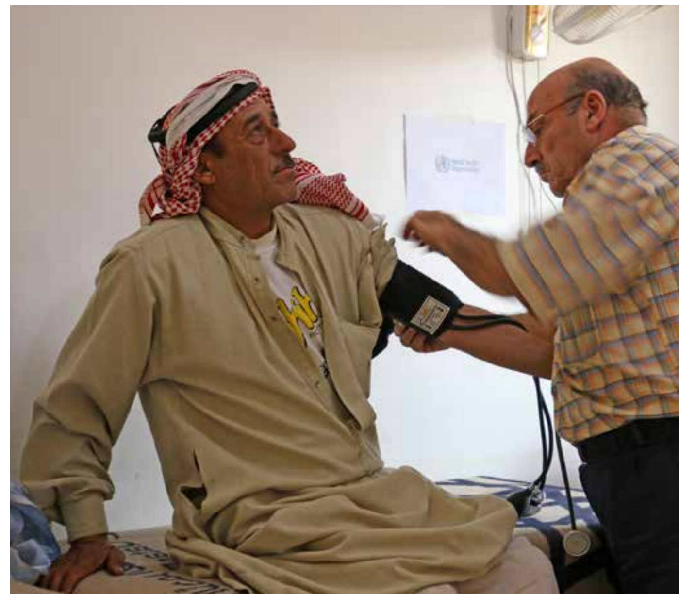
NCD patient receives care at Zerdana PHC in Idlib northwestern Syria.