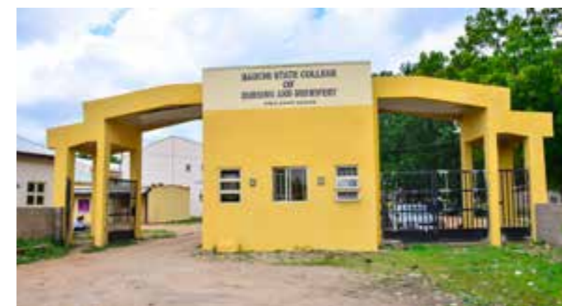
Bauchi State College of Nursing and Midwifery.