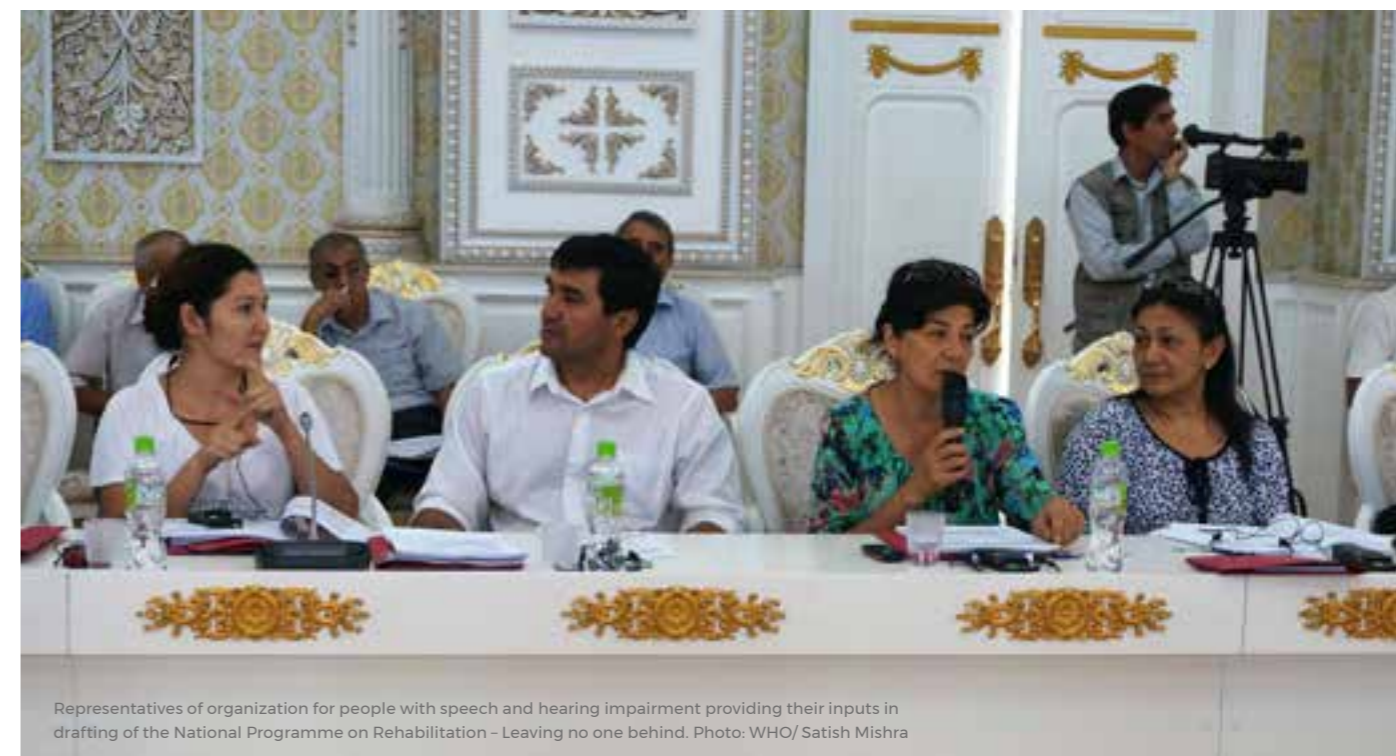
Representatives of organization for people with speech and hearing impairment providing their inputs in drafting of the National Programme on Rehabilitation – Leaving no one behind.