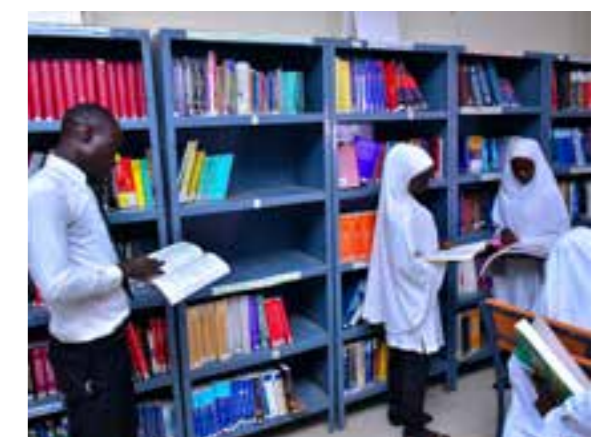
The College of Health Technology Ningi library.