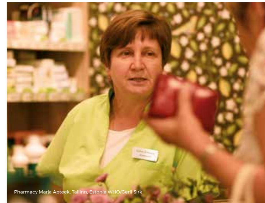
Pharmacy Marja Apteek, Tallinn, Estonia

The experience of Estonia and other countries – documented in a new WHO study – demonstrates that although co-payments cause financial hardship, especially for poor people, it is possible to make medicines more accessible and affordable for everyone. Countries can take progressive steps towards UHC by putting people at the centre of health reforms, and designing systems to meet patients' needs.