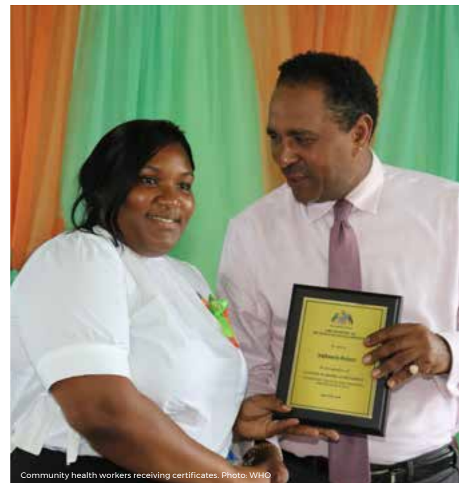
Community health workers receiving certificates.

two to three years to implement the major recommendations actions needed for the transformation of the health system. But already, communities are beginning to enjoy the impact of being able to access primary health services where skilled, qualified and motivated CHWs are hard at work.