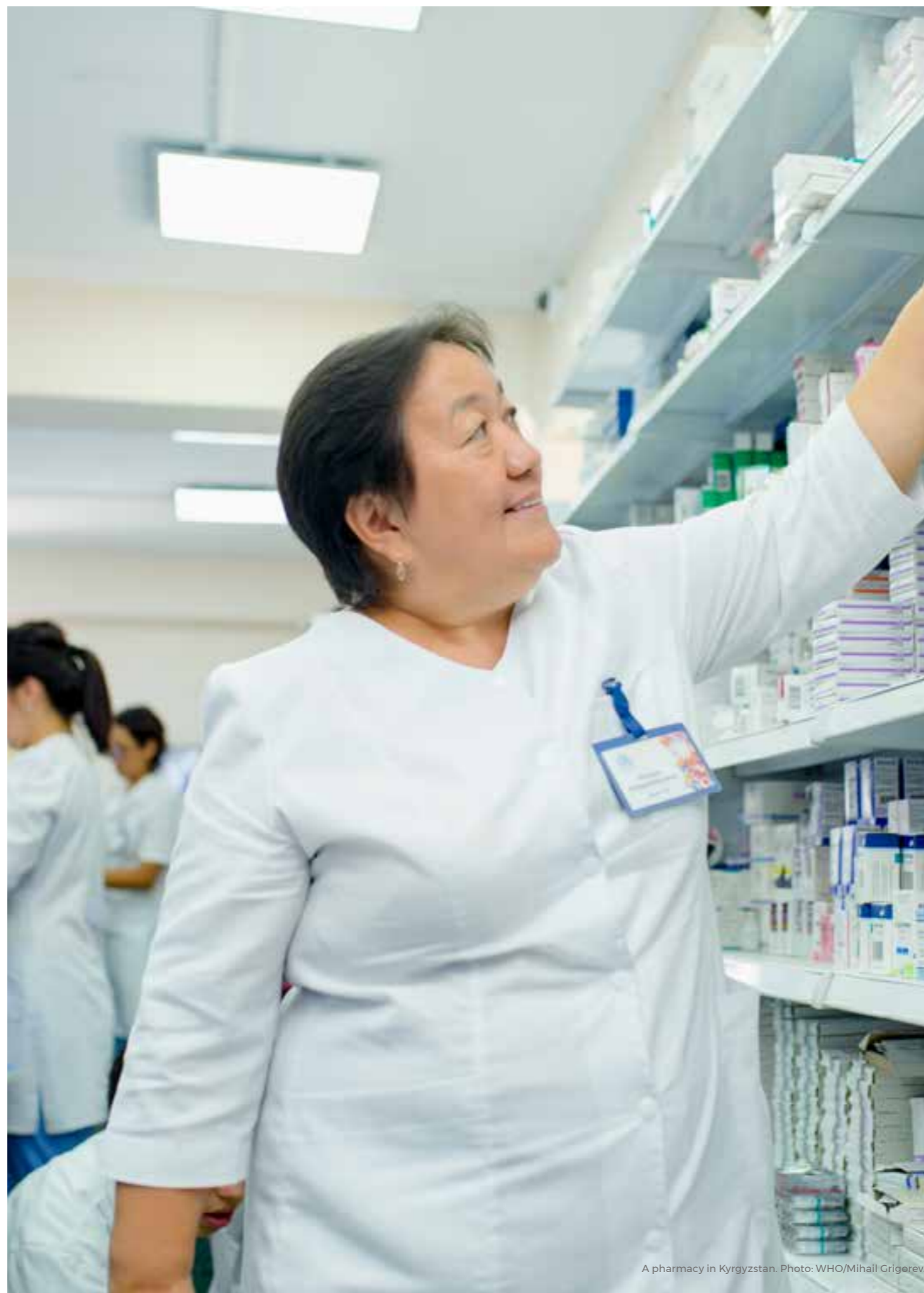
A pharmacy in Kyrgyzstan.

Going forward, WHO will continue to work closely with the Ministry of Health in ensuring access to essential medicines. Effective regulatory systems are an essential component of health systems and contribute to better public health outcomes. WHO plays a pivotal role in supporting countries in strengthening their regulatory systems to ensure that all medicines brought into the market are safe and effective.