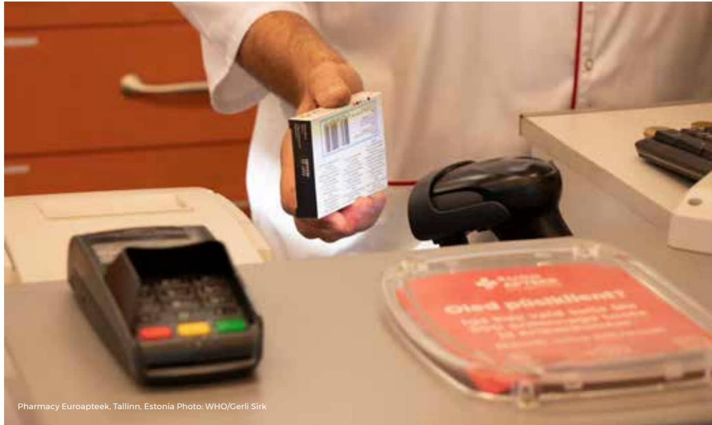
Pharmacy Euroapteek, Tallinn, Estonia