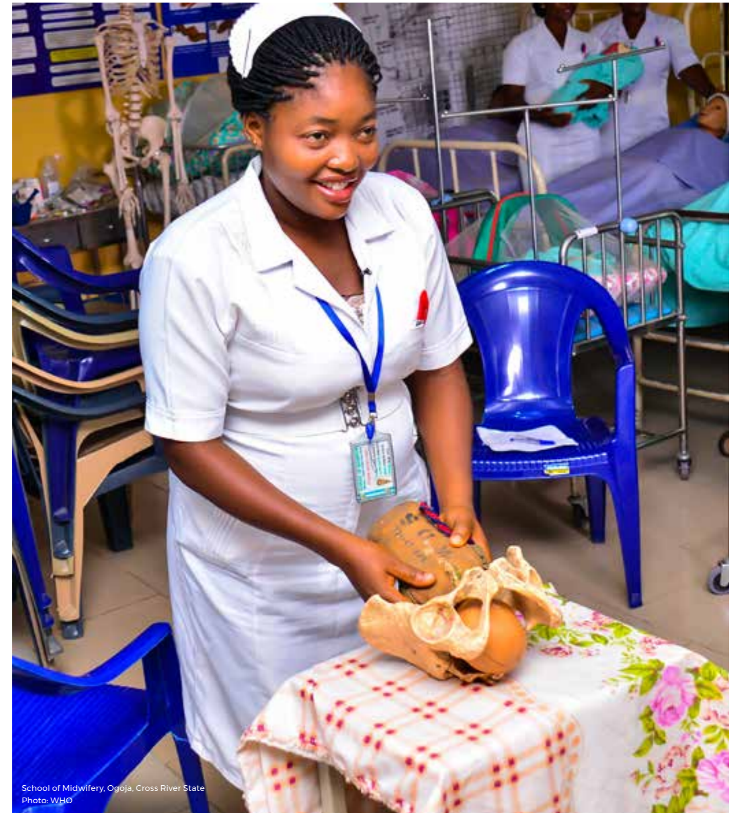
School of Midwifery, Ogoja, Cross River State

The College of Health Technology Ningi has also grown its capacity to deliver world-class health training. The library is restocked with new books, and is now benefitting from new technology and equipment, instructional materials and student handbooks and curriculum. These interventions resulted in the Community Health Practitioners Board of Nigeria granting the school accreditation.