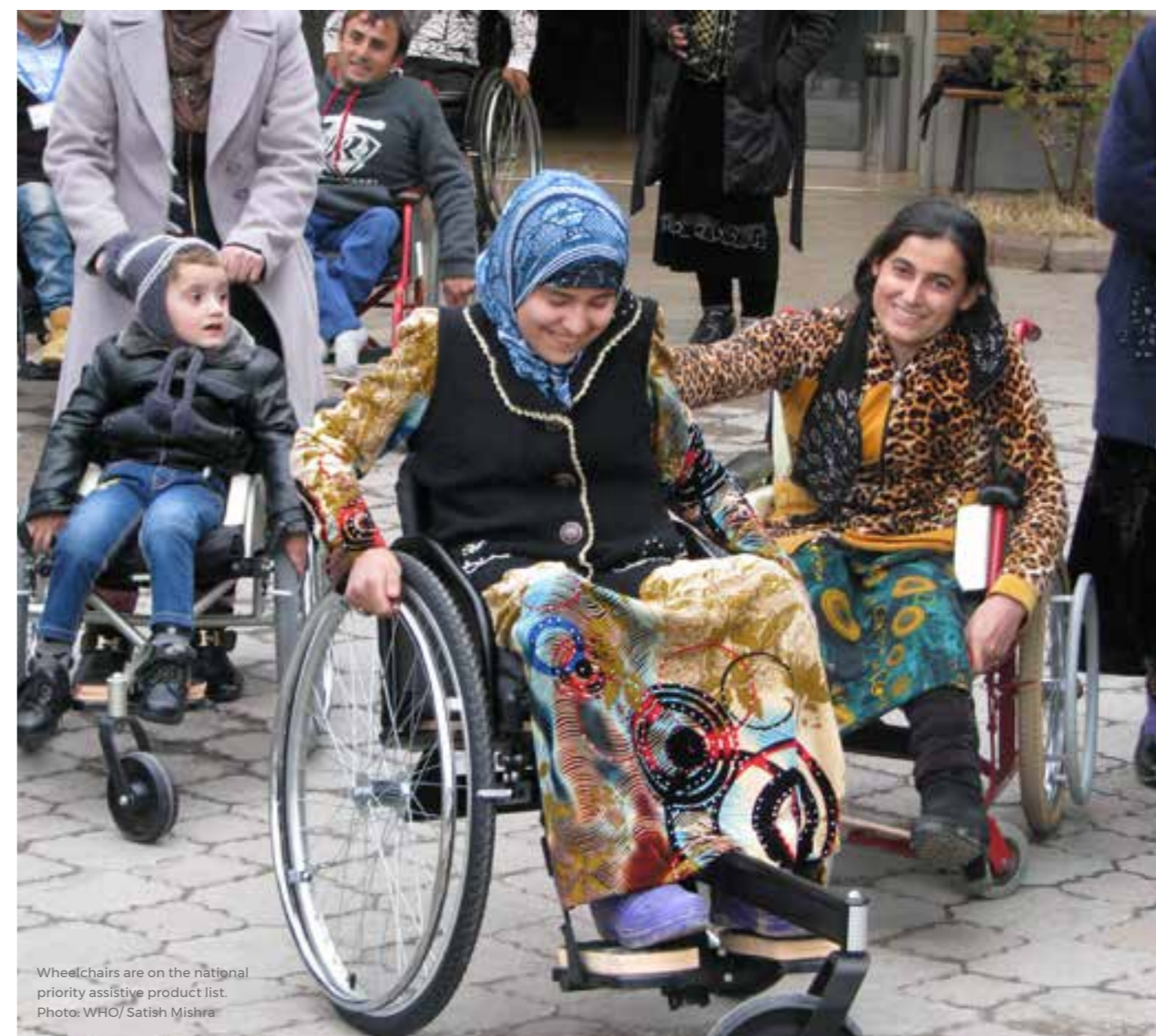
Wheelchairs are on the national priority assistive product list.