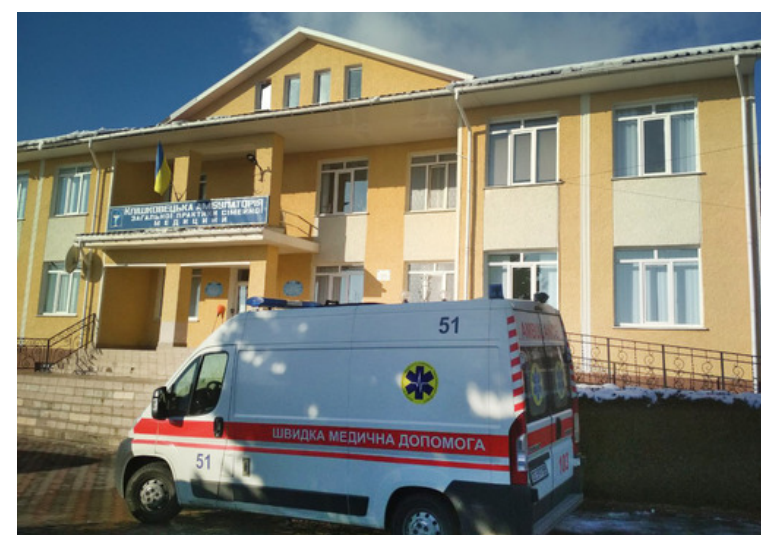
Primary healthcare center in Klishkivtsi village, Chernivtsi region

The vast majority of primary health care facilities now receive more funds than under the old financing mode, which was based on grants from central to local budgets. The government budget for PHC services has increased significantly, demonstrating serious commitment to UHC and PHC.