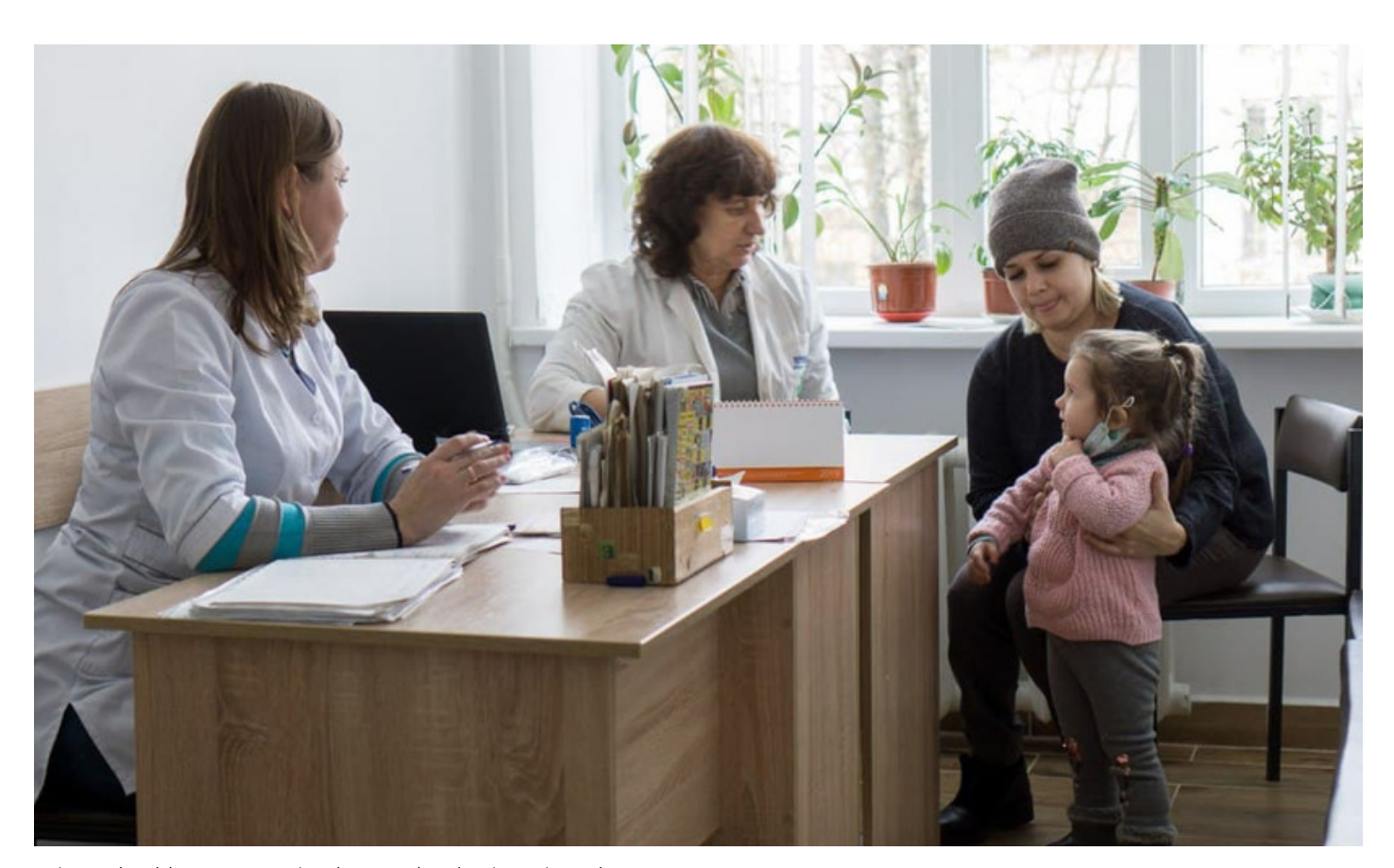
Primary healthcare center in Chervonohrad, Lviv region.

So what is the new financing model and why is it so effective?