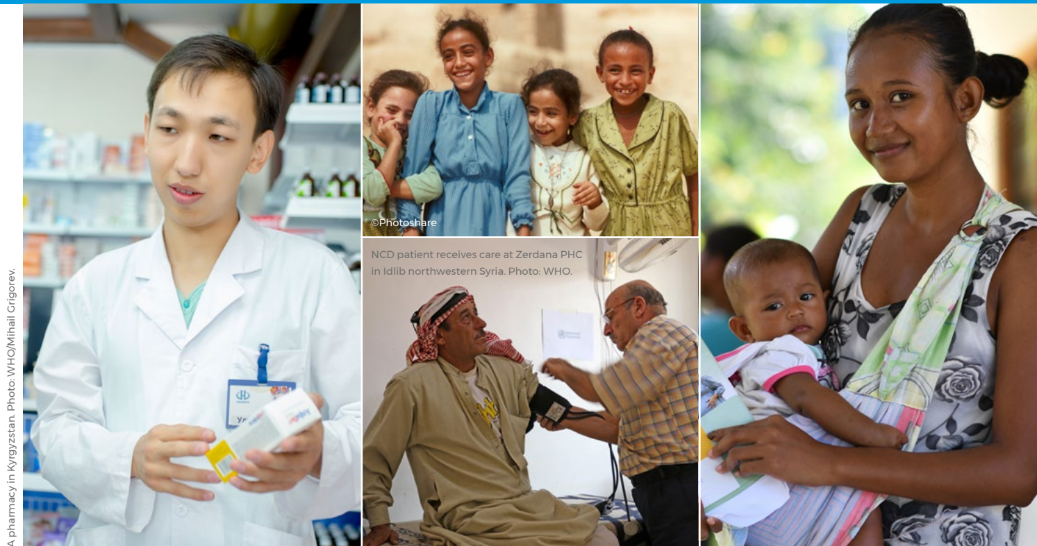
A pharmacy in Kyrgyzstan