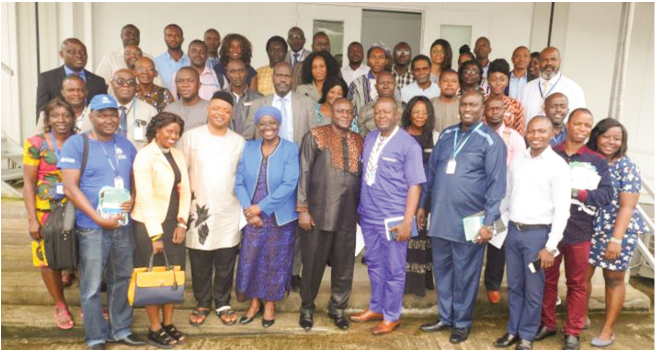
Ministry of Health and Sanitation in collaboration with WHO (AFRO and Country Office) held a NAPHS strategic advocacy engagement meeting with Members of the Parliament Committee on Health

being undertaken to engage communities and exchange information internally and with partners.