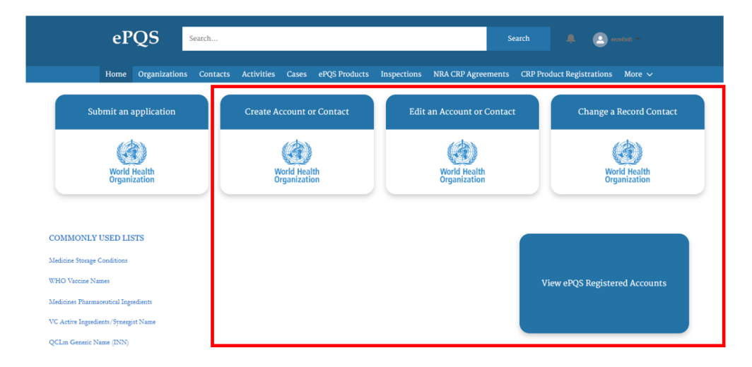
Figure 1: Account-Contact related tile on the Portal home page.

For a new portal user it is likely the creation of the contact record will occur as part of the registration process. It is also possible that the account creation process may also occur as part of the registration purpose if this is a new organization using the portal